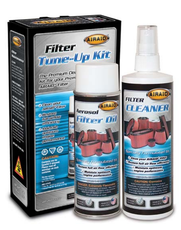
P/N 790-551 Aerosol Spray P/N 790-550 Squeeze Spray