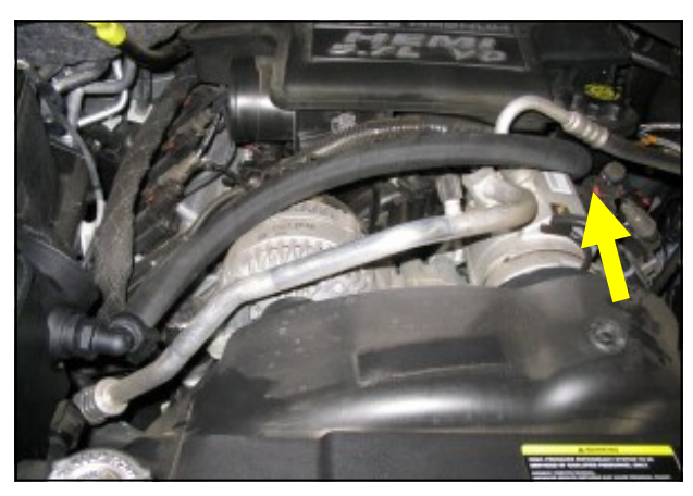
8. 5.7 Hemi engines only . Using the supplied straight <sup>3</sup>/<sub>4</sub>" hose, connect both ends to the nylon fitting and oil fill nipple as shown. Fasten both ends using the supplied nylon speed clamps. Adjust the nylon fitting downward to clear the factory intake tube assembly.