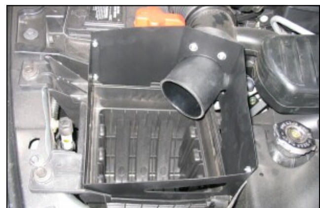
6. Install the Airaid Cool Air Dam assembly on top of the factory air filter base. Reconnect the factory intake tube, and tighten the hose clamp.