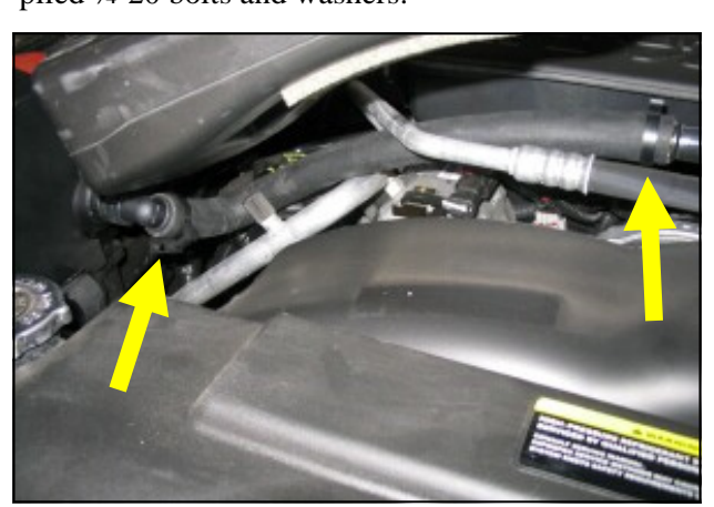
7. 4.7L engines only . Using the supplied preformed 3/4" hose, connect the nylon fitting to the remaining plastic factory hose as shown. Fasten both ends of the hose using the supplied nylon speed clamps. Adjust the fitting downward to clear the factory intake tube assembly.