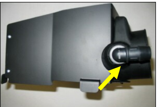
5. Install the supplied nylon fitting into the air filter adapter as shown.