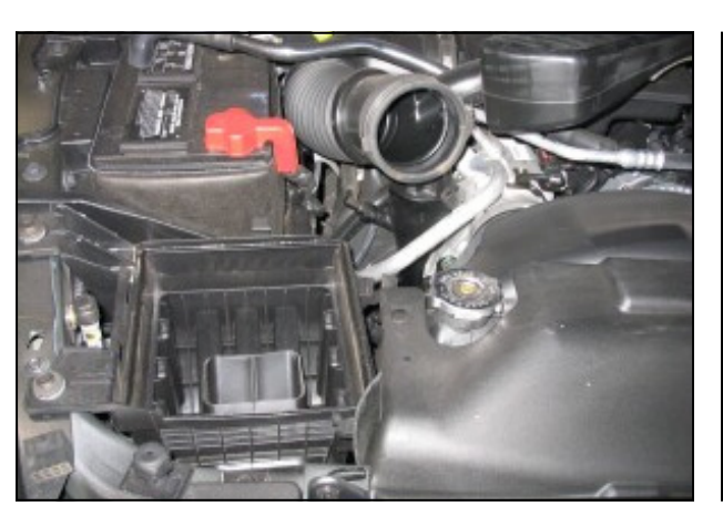
2. Loosen the hose clamp on the air box lid and remove the lid from the air box base.