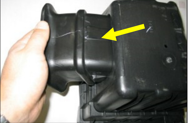
3. Using a 13mm socket, remove the air box base from the engine compartment. Using a flat blade screwdriver, carefully unsnap the box inlet from the base and remove it. Reinstall the factory base in the engine compartment without the inlet.