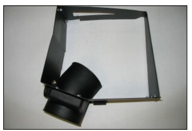
4. Using the supplied #6 screws, nuts and washers, assemble the two panels as shown above. Next, install the supplied air filter adapter using the supplied ½-20 bolts and washers.