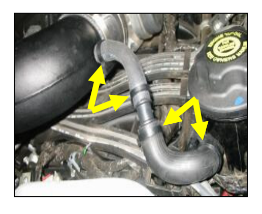
17. <u>2003 Models Only:</u> Use the plastic barbed fitting and ½" hose provided; connect factory vent hose to Airaid intake tube & secure the 1/2" hose with (2) #16 black speed clamps provided. Secure factory vent hose with (2) #22 black speed clamps provided.