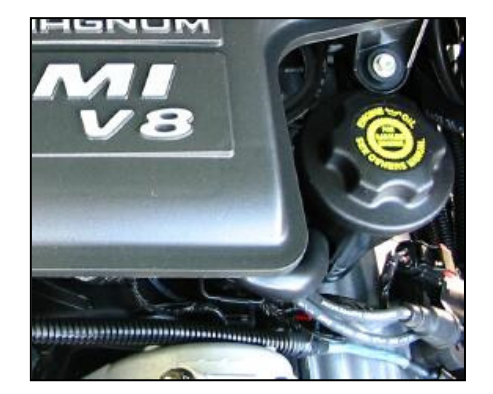
4. 2003 Models: Disconnect & remove the crankcase vent hose from the front of the factory resonator.