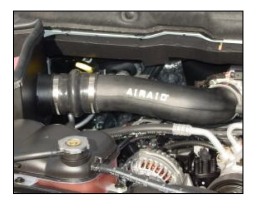
15. Slide the Airaid tube with hump hose into the Airaid Cool Air Dam first, and then slide the other end into the throttle body coupler. (Note: The Airaid tube should be flush against throttle body with a gap between the tube and Cool Air Dam assembly for engine movement.) After inspection, adjust the Airaid tube, coupler, and hump hose and tighten all hose clamps