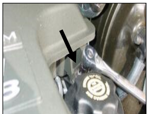
2. Loosen the two 10mm bolts securing the factory resonator to the intake manifold.