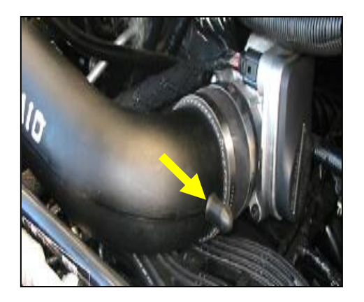
18. <u>2004-05 Models Only:</u> Slide the black rubber cap over the nipple near the throttle body end of the Airaid Tube.