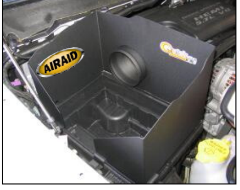
8. Position the Airaid Cool Air Dam in place of the original air box lid. Snap in place. Apply the Airaid Foil Decal onto the Panel as shown.