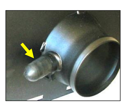
10. 2003 Models Only: Slip the black rubber cap over the nipple on the Cool Air Dam and secure using the #19 black speed clamp provided.