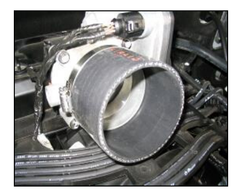
14. Slide the urethane coupler onto the throttle body and secure using a #60 hose clamp provided & install the 2nd #60 hose clamp on the other end of the coupler, leave loose for final assembly.