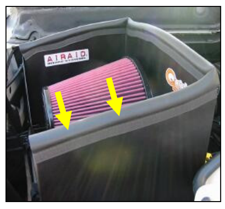
19. Install weather strip along the top rim of the Airaid Intake System. (Hint: start the install at the top corner of the cold air dam)