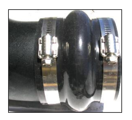
13. Install the urethane hump hose on the long end of the Airaid tube using two of the #60 hose clamps provided. Leave loose for final assembly.