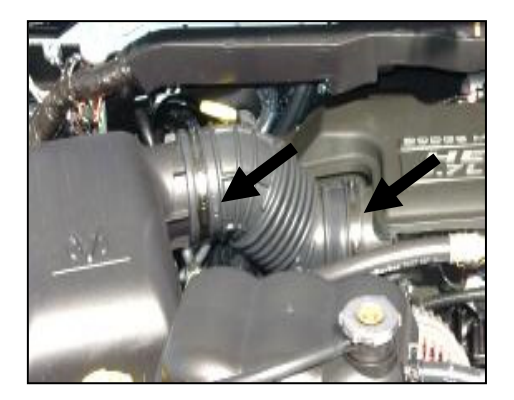
1. Disconnect the negative battery cable, and remove the factory "accordion" style intake hose by loosening the two factory clamps.