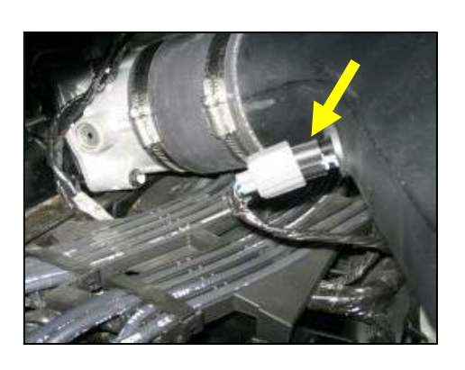
16. Re-connect air temperature sensor connector.