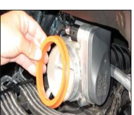
6. Remove the factory resonator and rubber seal from throttle body.