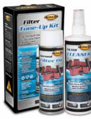
P/N 790-551 Aerosol Spray P/N 790-550 Squeeze Spray