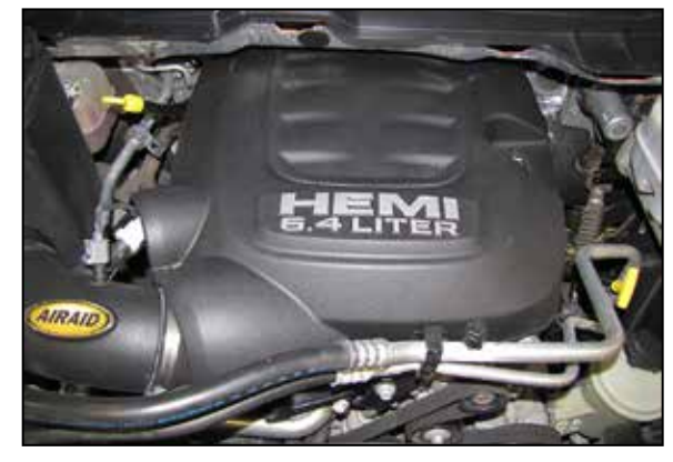
18. Reinstall the decorative engine cover.