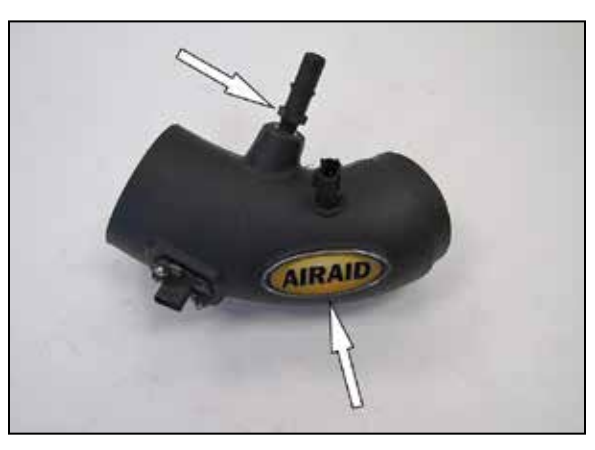
12. Install the provided quick connect vent fitting and AIRAID® decal onto the AIRAID® intake tube as shown. NOTE: Plastic NPT fittings are easy to cross thread. Install the vent fitting "hand" tight, then turn it two complete turns with a wrench.

NOTE: Some vehicles may not be equipped with the mass air sensor, If your vehicle does not have a mass air sensor install the provided block off and gasket.