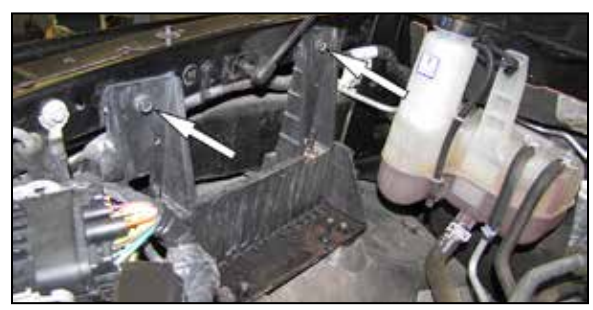
6. Remove the two upper filter housing bracket mounting bolts.

NOTE: Some model will have the A/C lines and heater hose tube secured to the lower air filter housing. Remove the two bolts that secure the heater hose tube and unsnap the A/C lines before removing the housing from the vehicle.