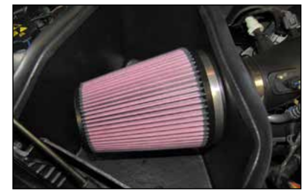
17. Install the air filter onto the filter adapter and secure with the provided hardware.