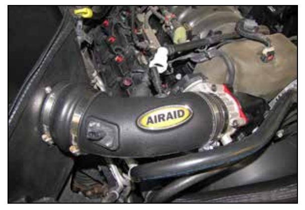
15. Install the AIRAID<sup>®</sup> intake tube into the hump coupler and onto the throttle body, adjust the tube and couplers for best fit and then secure with the provided hose clamps.