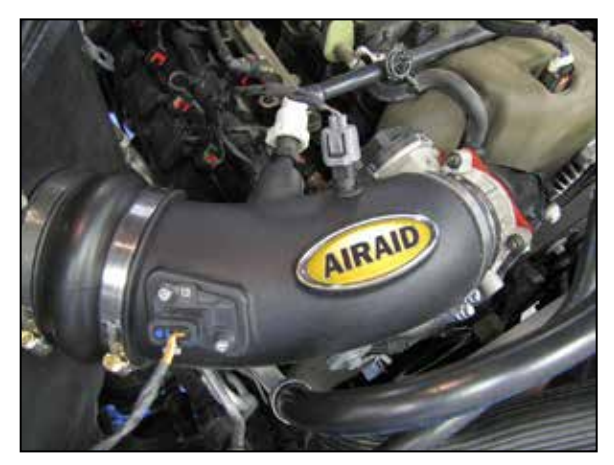
16. Connect the crank case vent to the fitting installed into the AIRAID<sup>®</sup> intake tube. Reconnect the mass air sensor and inlet air temperature sensor electrical connections.