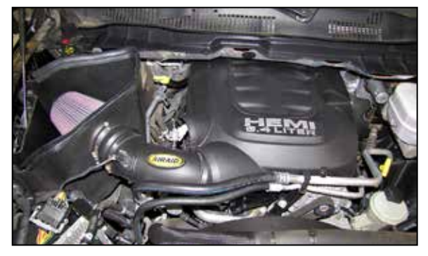
19. Double check your work! Make sure there is no foreign material in the intake path. Make sure all clamps, hoses, bolts, and screws are tight. Double check the hood clearance! Reconnect the negative battery cable!

Thank you for purchasing the Airaid Intake System. Contact Airaid @ (800) 498-6951 8:00 AM - 5:00 PM MST weekdays for questions regarding fit or instructions that are not clear to you. Your Airaid Intake System was carefully inspected and packaged. Check that no parts are missing, or were damaged during shipping. If any parts are missing, contact Airaid. The air filter element is protected from direct exposure to water and debris; care should be taken not to drive through deep water. WATER INGESTION IS THE DRIVERS RESPONSIBILITY! The air filter is reusable and should be cleaned periodically.