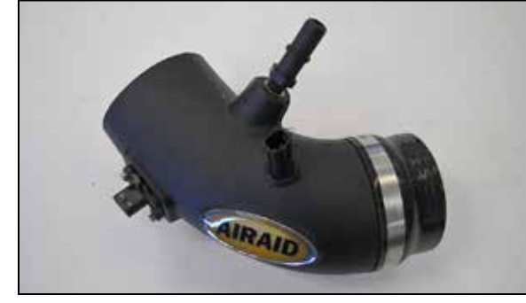
13. Install the provided step coupler onto the AIRAID<sup>®</sup> intake tube as shown.