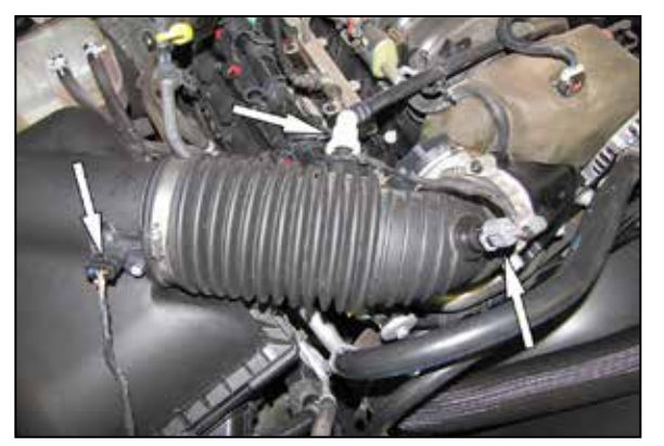
3. Disconnect the mass air sensor and inlet air temperature sensor electrical connections and disconnect the crank case vent quick connect fitting.

5. Lift the lower air filter housing up and then remove the housing from the vehicle.