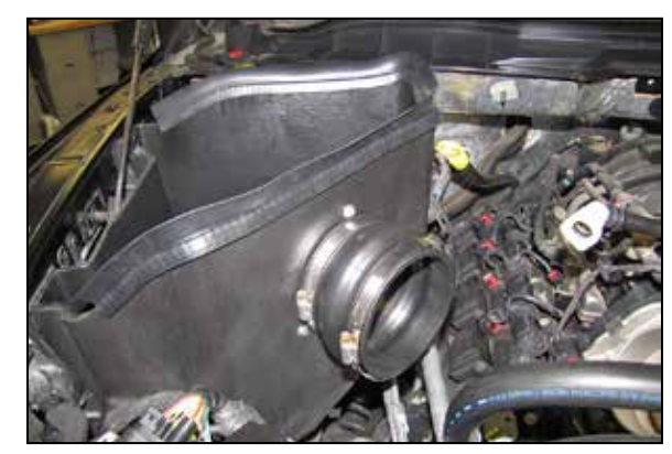
14. Install the provided hump coupler onto the filter adapter as shown.