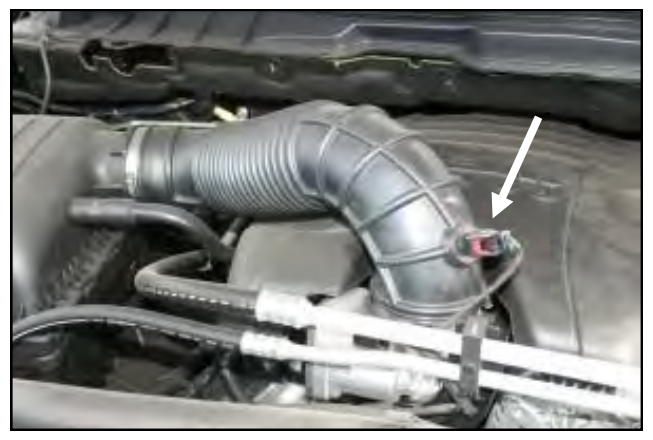
6. Reinstall the engine cover and intake tube in the reverse order that they were removed. Make sure to reconnect the temperature sensor.