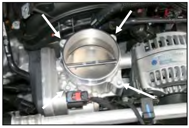
2. Remove the four bolts that secure the throttle body to the intake manifold. Without disconnecting the wiring harness, remove the throttle body from the intake manifold and set it

Disconnect the air intake temperature sensor wiring harness by sliding the red tab, and then squeezing the black tab. Loosen two hose clamps, one on each end of the flexible air intake tube. Remove the tube from the vehicle. Lift straight up on the front of engine cover, pull it towards you, and set it aside.