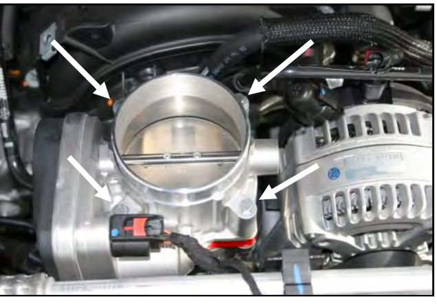
5. Reinstall the throttle body on top of the Airaid Spacer using the four bolts and the washers that were selected in step 3. Tighten the bolts evenly, in an X pattern, to the vehicle manufacturers specifications.