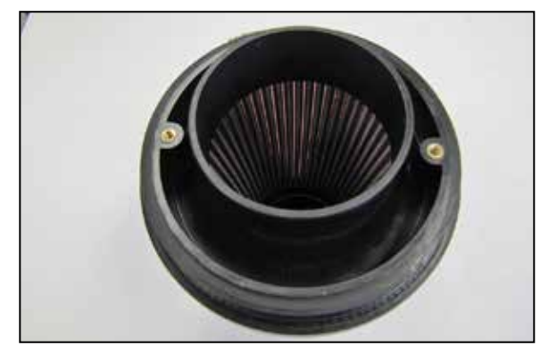
8. Install the radius adapter into the air filter as shown and secure with the provided hose clamp.