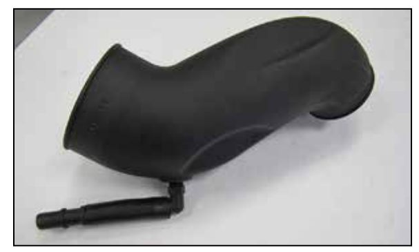
16. Install the assembled crank case hose assembly onto the AIRAID intake tube as shown.

NOTE: Plastic NPT fittings are easy to cross thread. Install the vent fitting "hand" tight, then turn it two complete turns with a wrench.