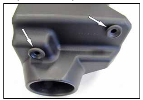
11. Remove the two mounting grommets from the factory air filter housing and install them into the AIRAID air filter housing as shown.