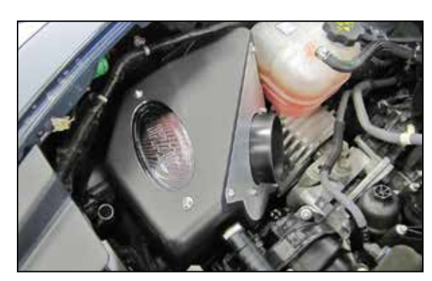
12. Install the AIRAID air filter housing assembly into the vehicle as shown so that it secures onto the factory housing mounting locations.