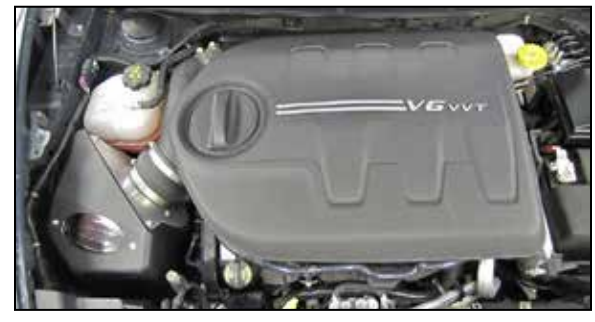
20. Double check your work!Make sure there is no foreign material in the intake path.Make sure all clamps, hoses, bolts, and screws are tight.Double check the hood clearance!Reconnect the negative battery cable!

19. Reinstall the decorative engine cover. NOTE: It may be necessary to adjust the intake tube for clearance with the engine cover.