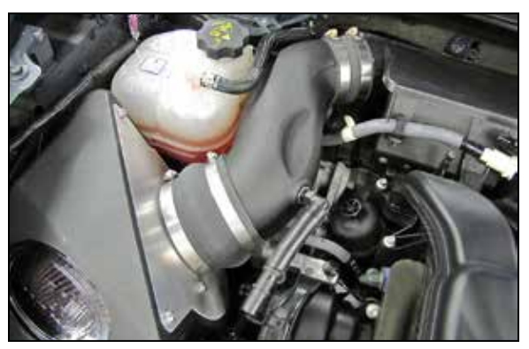
17. Install the intake tube assembly into the coupling hoses, adjust for best fit and then secure with the provided hose clamps.

NOTE: Plastic NPT fittings are easy to cross thread. Install the vent fitting "hand" tight, then turn it two complete turns with a wrench.