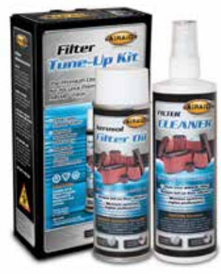
P/N 790-551 Aerosol Spray P/N 790-550 Squeeze Spray

For your Oiled media filter we offer the Airaid Tune Up Kit!