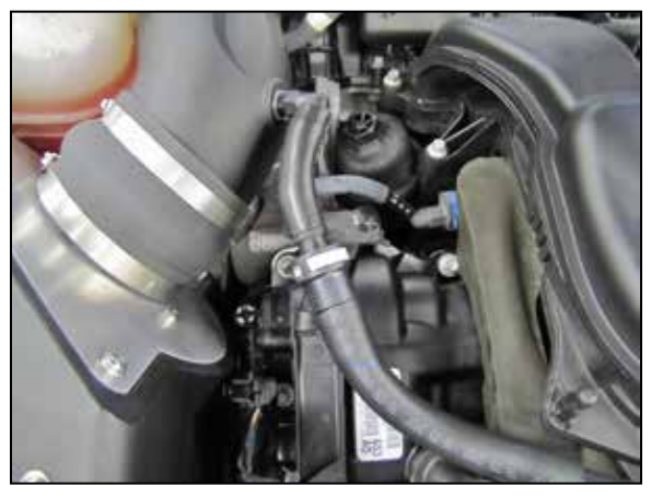
18. Connect the factory crank case quick connect fitting to the quick connect fitting installed onto the AIRAID intake tube.