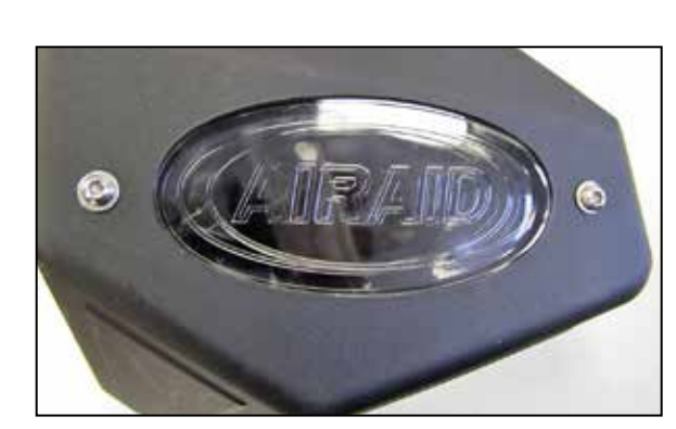
5. Install the AIRAID window into the AIRAID air filter housing using the provided hardware.