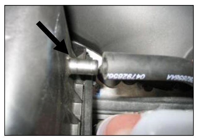
2. Disconnect the breather hose from the factory air box lid.