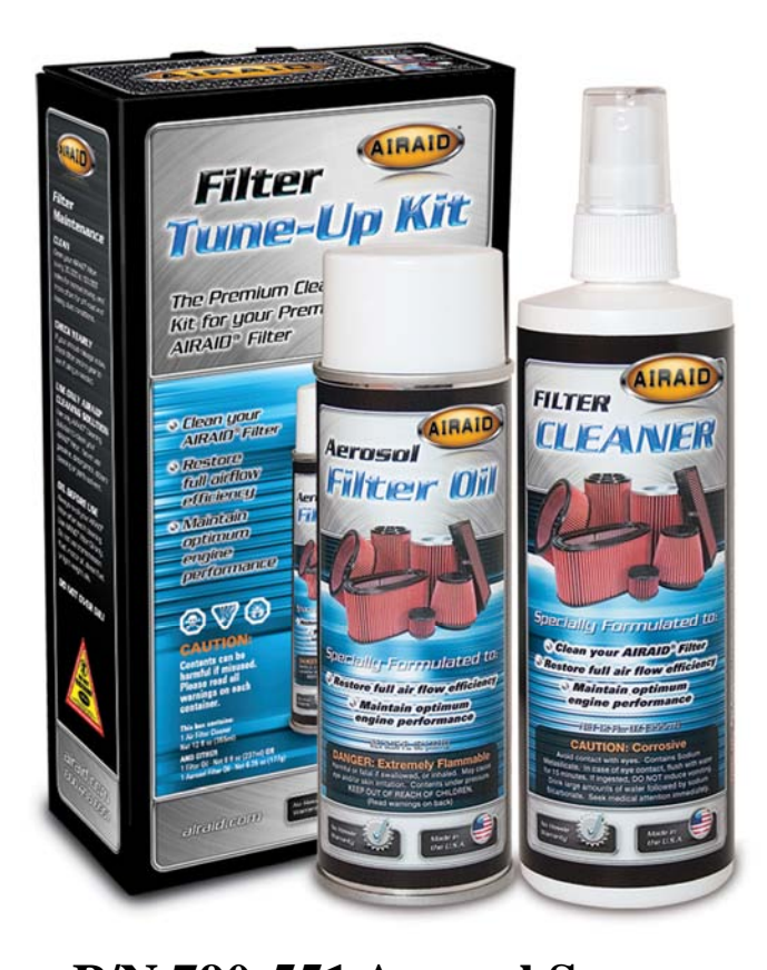
P/N 790-551 Aerosol Spray P/N 790-550 Squeeze Spray