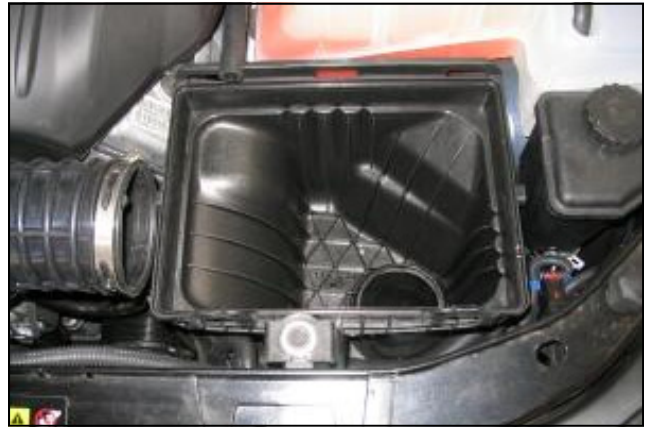
3. Remove the factory air box lid and flat panel filter. ( Note: Retain the factory air box base.)