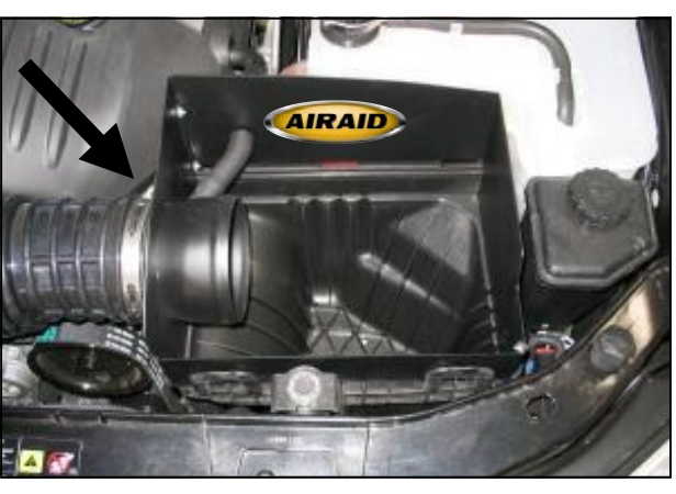
5. Install the Airaid CAD in place of the factory air box lid. Tighten factory hose clamp. Apply the Airaid Foil Decal onto the Panel as shown.