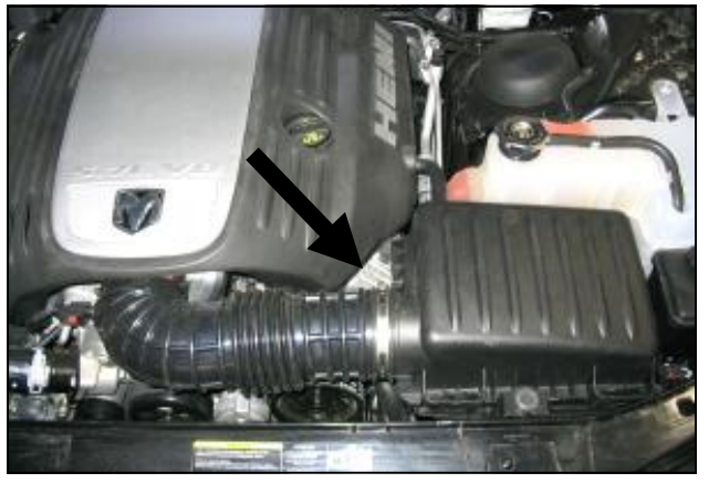
1. Loosen the hose clamp on the intake tube.