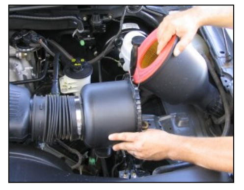
1. Disconnect negative battery cable. Unclip factory filter housing from intake assembly.