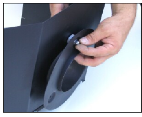
4. Assemble the Airaid Filter Adapter plate using the supplied 1/4 inch bolts, washers, spacers and nuts provided as shown above.