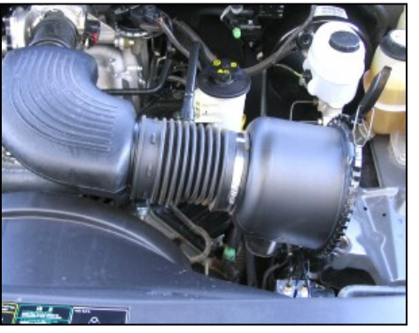
2. Remove air filter and air box from vehicle.