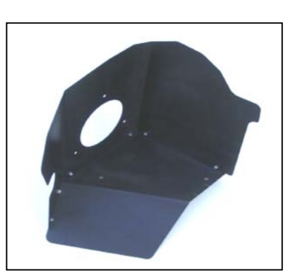
3. Assemble the Airaid Cool Air Dam assembly using the supplied #6 screws, washers and nuts as shown above.