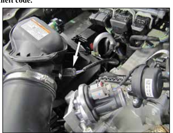
2. Disconnect the mass air sensor electrical connection.

NOTE: Disconnecting the negative battery cable erases pre-programmed electronic memories. Write down all memory settings before disconnecting the negative battery cable. Some radios will require an anti-theft code to be entered after the battery is reconnected. The anti-theft code is typically supplied with your owner's manual. In the event your vehicles anti-theft code cannot be recovered, contact an authorized dealership to obtain your vehicles anti-theft code.