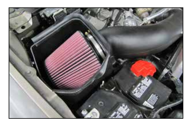
13. Install the air filter onto the intake tube and secure with the provided hose clamp.