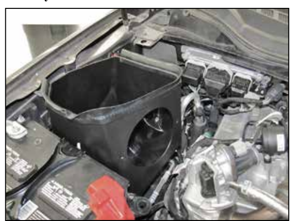
9. Install the AIRAID® housing into the vehicle so the mounting stud inserts into the mounting grommet and the fresh air intake opening sits around the fresh air duct. NOTE: Be sure not to pinch the wiring harness between the fresh air duct and AIRAID® housing.