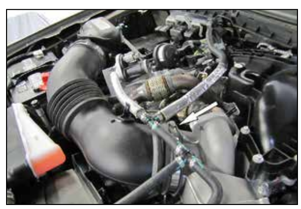
3. Loosen the hose clamp that secures the factory intake tube to the turbo inlet, release the four clips that secure the upper air filter housing and then remove the assembly from the vehicle.