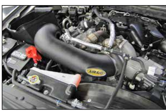
12. Install the AIRAID® intake tube into the AIRAID® housing and into the coupler at the turbo inlet. Adjust the tube for best fit and then secure with the provided hardware and hose clamp.