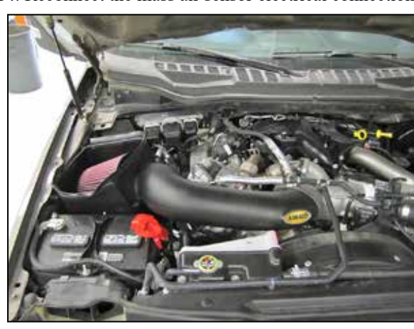
16. Double check your work! Make sure there is no foreign material in the intake path. Make sure all clamps, hoses, bolts, and screws are tight. Double check the hood clearance!