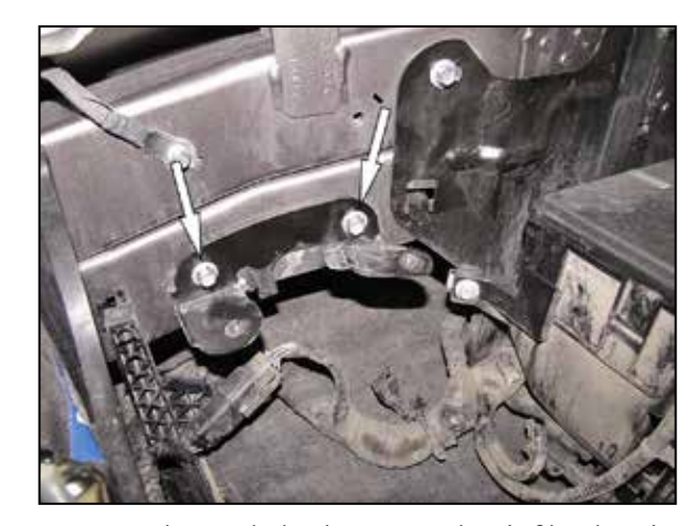
5. Remove the two bolts that secure the air filter housing mounting bracket to the inner fender and remove the bracket from the vehicle.