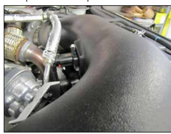
14. Reconnect the mass air sensor electrical connection.