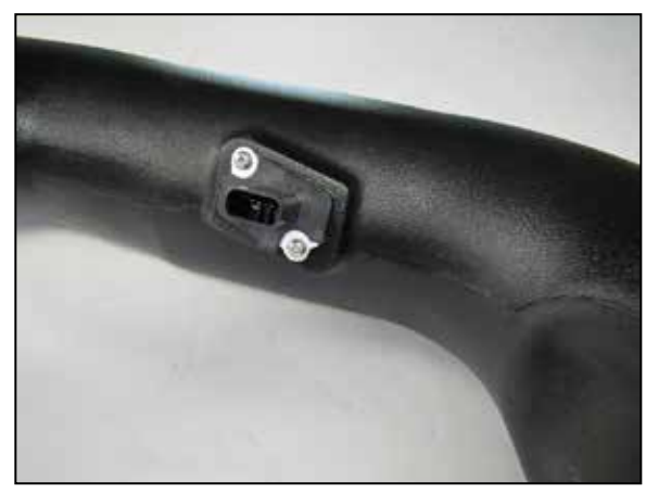
11. Remove the mass air sensor from the factory air filter housing and install it into the AIRAID® intake tube using the provided hardware and spacers. Install the AIRAID® decal onto the intake tube.