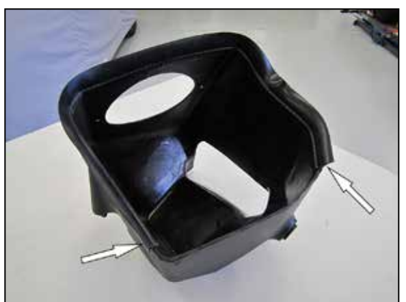
8. Install the provided weather strip onto the AIRAID® housing as shown.