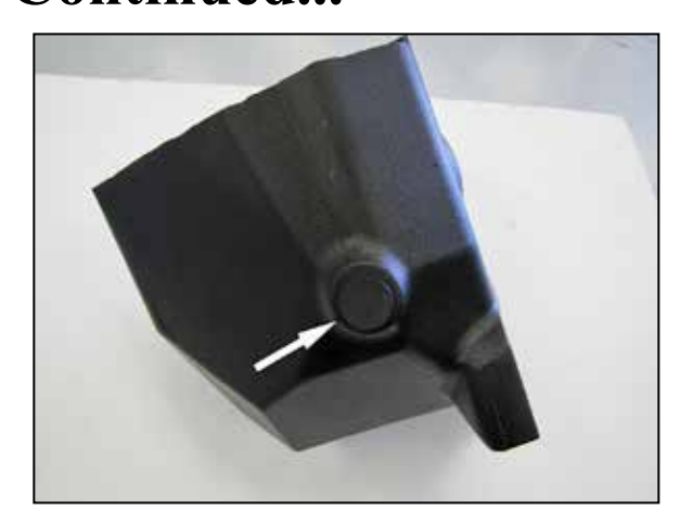
7. Install the provided bumper into the AIRAID® housing as shown.