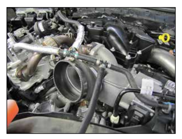
10. Install the provided coupler (08695) onto the turbo inlet and secure with the provided hose clamp.