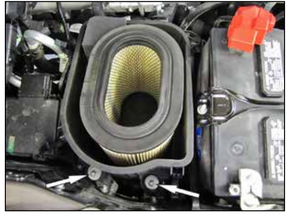
4. Remove the two bolts that secure the lower air filter housing to the mounting bracket, then pull the lower air filter housing straight up to dislodge it from the mounting grommets and remove it from the vehicle. NOTE: AIRAID recommends that customers do not discard factory air intake.