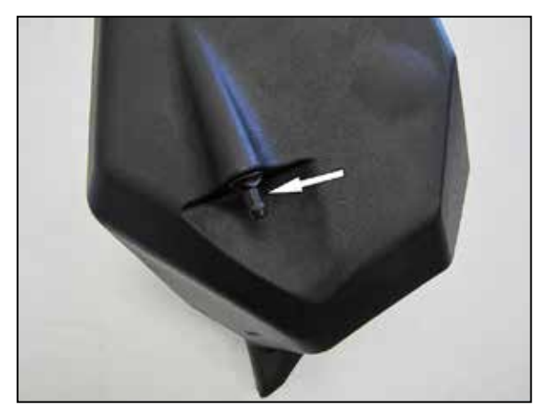
6. Install the provided air box mounting stud onto the AIRAID® housing using the provided hardware.