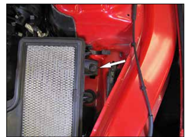
9. Remove the bolt that secures the lower air filter housing to the inner fender and then remove the lower housing from the vehicle.