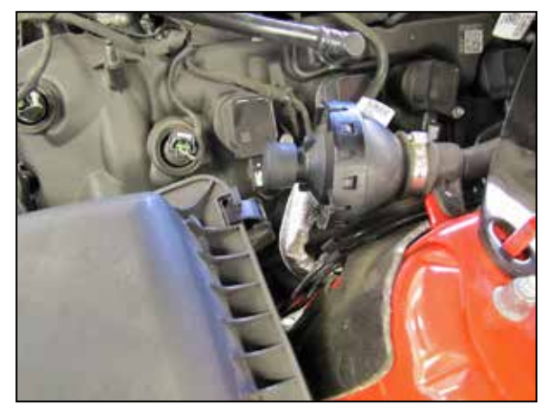
7. Install the provided cap onto the sound drum as shown.