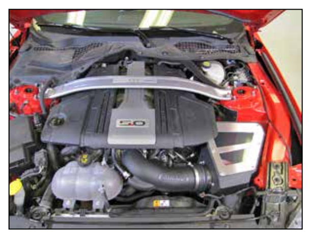
23. Double check your work! Make sure there is no foreign material in the intake path. Make sure all clamps, hoses, bolts, and screws are tight. Double check the hood clearance! Reconnect the negative battery cable!

contact Airaid. The air filter element is protected from direct exposure to water and debris; care should be taken not to drive through deep water. WATER INGESTION IS THE DRIVERS RESPONSIBILITY! The air filter is reusable and should be cleaned periodically.