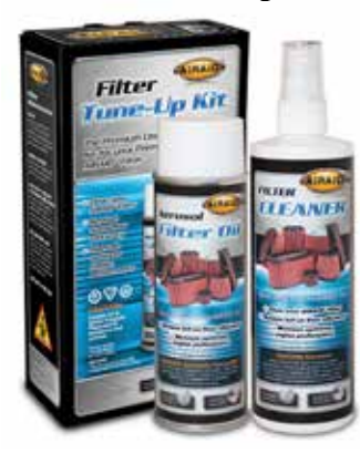
P/N 790-551 Aerosol Spray P/N 790-550 Squeeze Spray