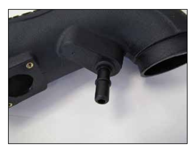
12. Install the large quick disconnect fitting into the AIRAID<sup>®</sup> intake tube using the provided grommet.