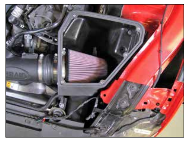
20. Install the AIRAID<sup>®</sup> air filter onto the filter adapter and secure with the provided hose clamp.