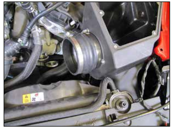
17. Install the provided hump coupler onto the filter adapter and secure with the provided hose clamp.