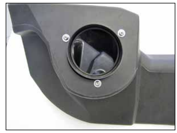
10. Install the provided filter adapter into the AIRAID<sup>®</sup> air filter housing and secure with the provided hardware.