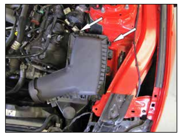
8.Release the two clips that secure the upper air filter housing and remove the upper housing from the vehicle.