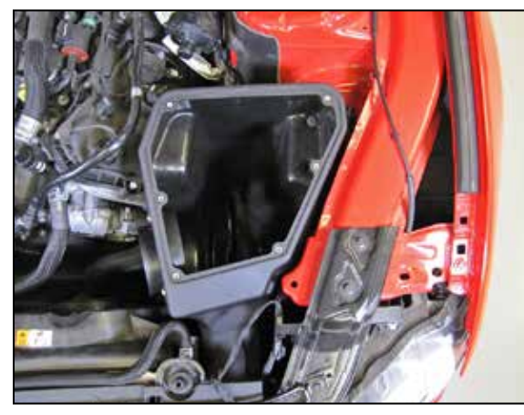
15. Install the AIRAID<sup>®</sup> air filter assembly into the vehicle and secure with the provided hardware.