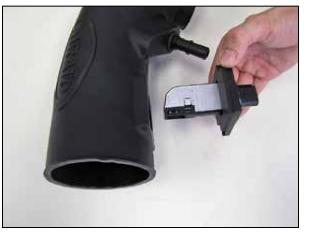
14. Install the mass air sensor assembly into the AIRAID<sup>®</sup> intake tube as shown and secure with the provided hardware.

13. Remove the mass air sensor from the factory air filter housing and then install it into the provided adapter along with the provided gasket.