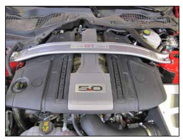
22. Reinstall the engine cover and strut tower brace and secure with the factory hardware.