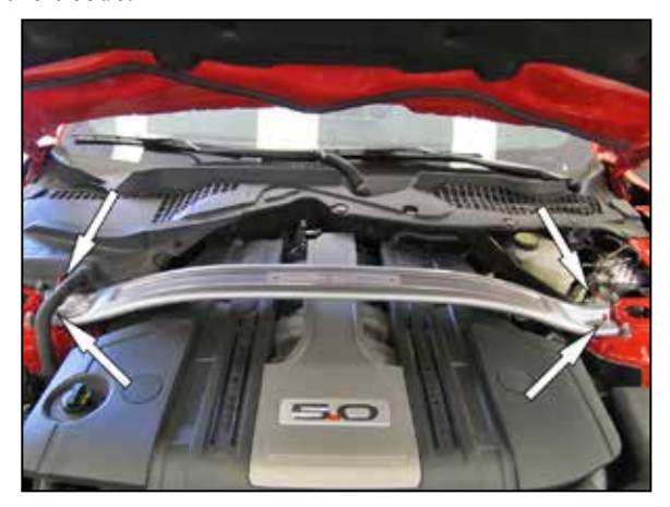
2. Remove the four nuts that secure the strut tower brace and then remove the strut tower brace from the vehicle.