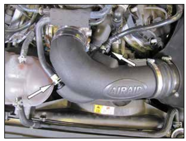
19. Connect the EVAP and crankcase vent lines to the fittings installed into the AIRAID<sup>®</sup> intake tube.

18. Install the AIRAID<sup>®</sup> intake tube into the coupler at the filter adapter and then into the coupler at the throttle body, adjust the tube for best fit and then secure with the provided hose clamps.