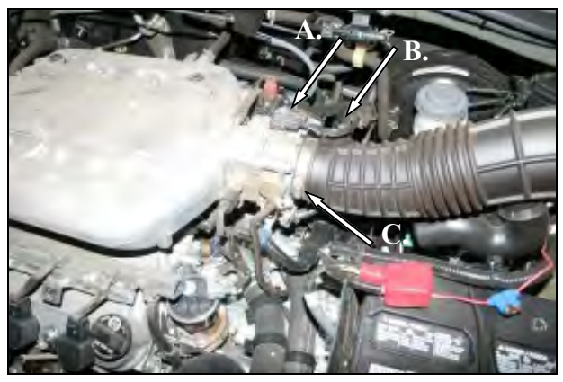
2. A.) Disconnect the wiring connector on the top of the throttlebody. B.) Squeeze the clamp with your fingers and disconnect the metal tube from the intake tube. C.) Using a 10mm socket, loosen the hose clamp on the throttle body end of the factory intake tube. Pull the intake tube out from between the throttle body and the airbox and set it out of the way.