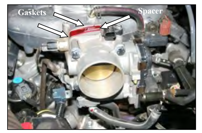
4. Install the spacer (#1) ( with the flat side of the helix bore facing the throttle body ) between the intake manifold, and the throttle body with one of the supplied gaskets (#2) on each side of the spacer. Insert four 8mm x 75mm Hex Bolts (#3), and 8mm Flat Washers (#4) through the throttle body, Airaid Spacer, and into the intake manifold. Using a 13mm socket, tighten all 4 throttle body bolts evenly, to the manufacturer's specifications.