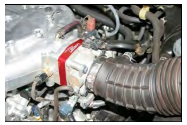
5. Reinstall the factory intake tube, and tighten the hose clamp. Reconnect the metal tube to the intake tube. Reconnect the throttle body wiring connector. Reinstall the engine beauty cover. Re-connect the negative battery cable!