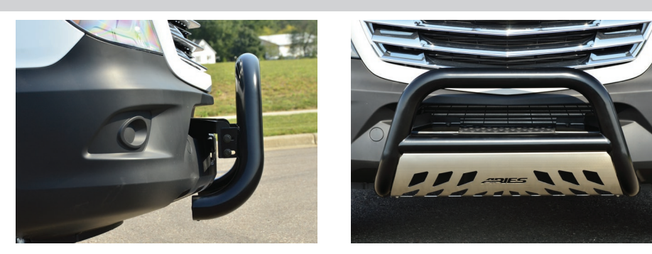
Optional license plate relocation bracket #35-0000 sold separately

To protect your investment, see the 'Notes and Maintenance' section on the first page of this instruction manual.