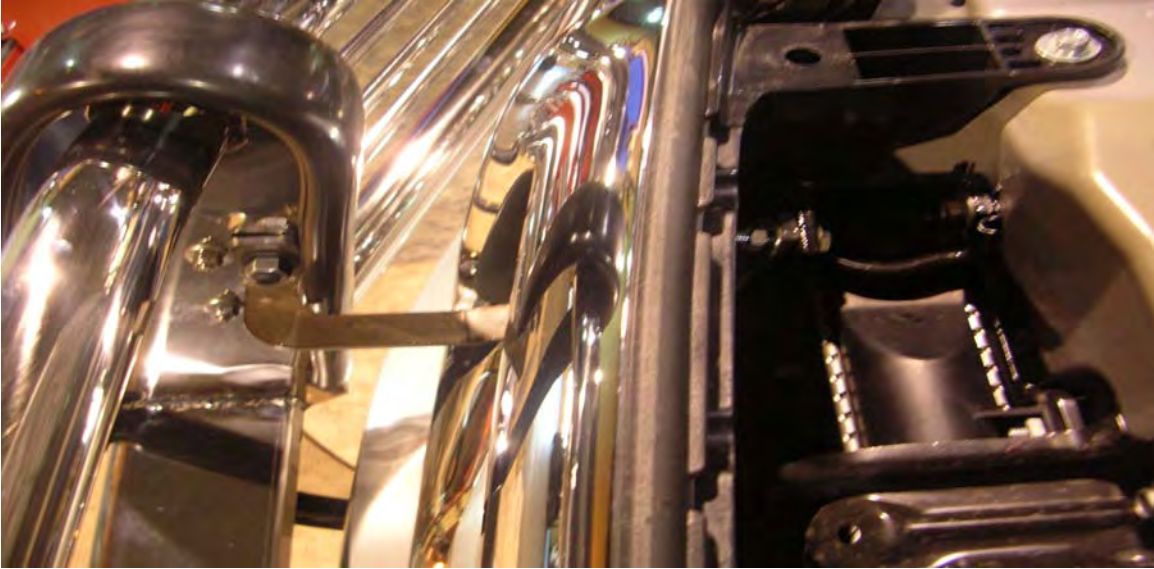
Diagram number 4. Brace bracket installed through grill opening