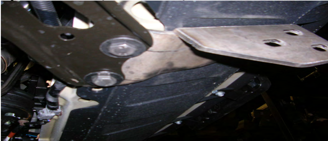
Diagram number 2. Brace bracket location