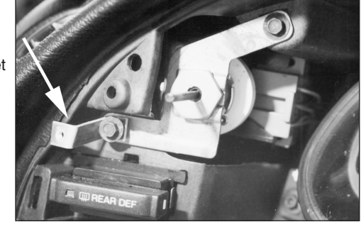
Fig. 1 -Short Bracket