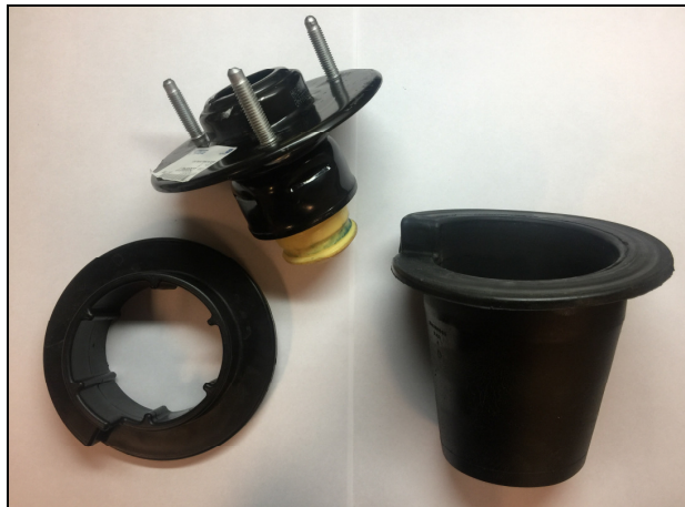
Fig 1: '07-'13 OE Top Mount Components