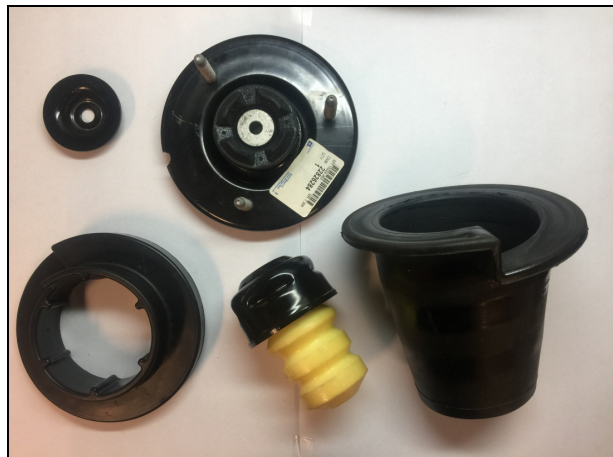
Fig 2: 2014+ OE Top Mount Components