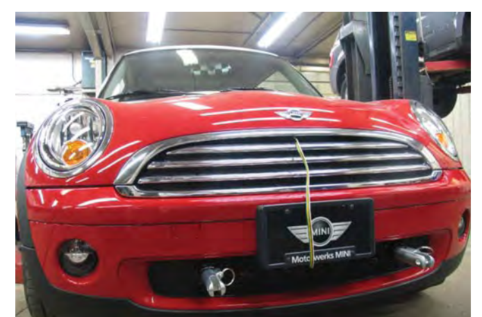
Shown with removeble tabe installed.

If the baseplate is in an accident, it must be replaced. DO NOT use it again! An accident can cause unseen damage and using it again could result in more damage or serious injury. DO NOT use the paseplate if it is damaged or missing parts.