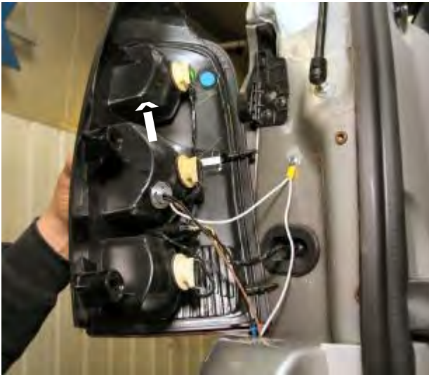
Location for the Bx8869 on driver's side tail light assembly.