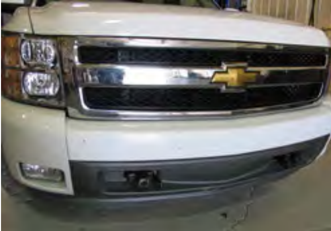
2007 - shown without removable tabs installed