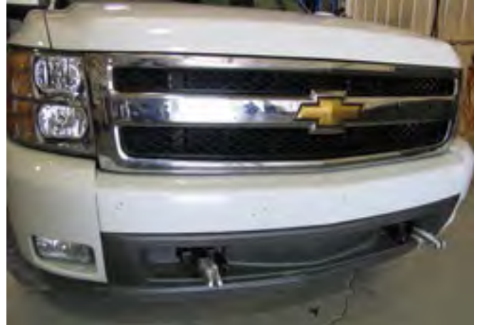
2007 - shown with removable tabs installed