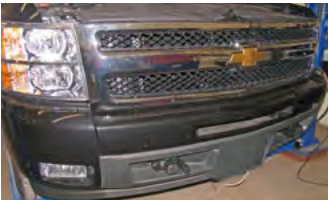
2009 - shown without removable tabs installed