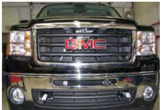
2011 - shown with removable tabs installed