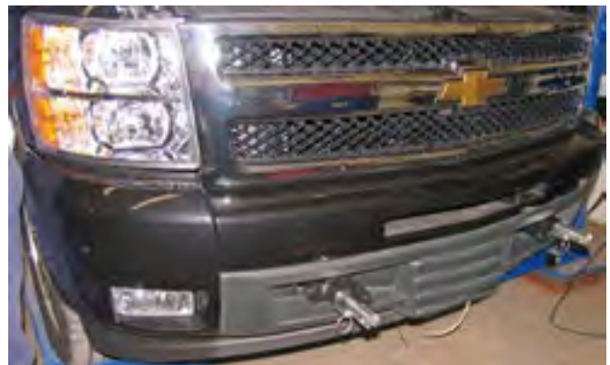
2009 - shown with removable tabs installed