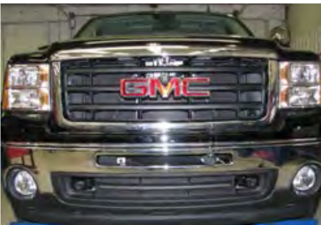
2011 - shown without removable tabs installed