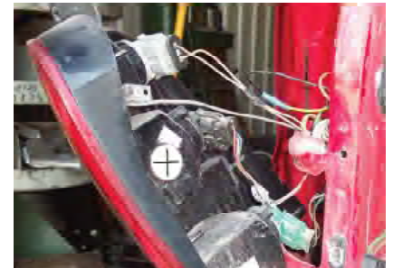
Location for the BX8869 on the driver's side.