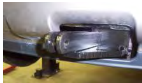
View of driver's side.