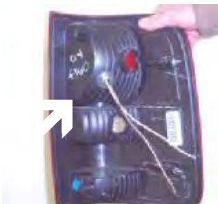
Locations for the Bx8869 on driver's side tail light assembly.