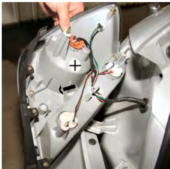
Location for the bulb and socket (Bx8869) on driver's side tail light assembly.