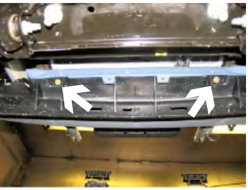
7. Using the 10MM socket, remove the two metric bolts from the bottom edge of fascia just below radiator support.