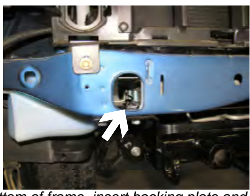
11. Align baseplate with the two existing holes in the bottom of frame, insert backing plate and nut plates into opening on the end of frame rail to align with these existing holes, both sides. Some vehicles may need to have these existing holes reamed to acquire proper fit. Tighten the 3/8" hex bolts, flat and lock washers with the 9/16" socket, both sides. Be sure and use Loctite Red on all bolts before tightening. Tighten all bolts according to Torque Chart in the General Instruction Sheet. Note: Some models may have tow hooks that will need to be removed and will not be reinstalled.