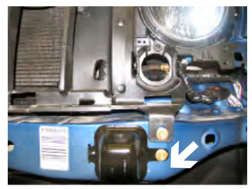
10. Remove the metric bolt from hub with the 10MM socket and set hub aside, both sides.