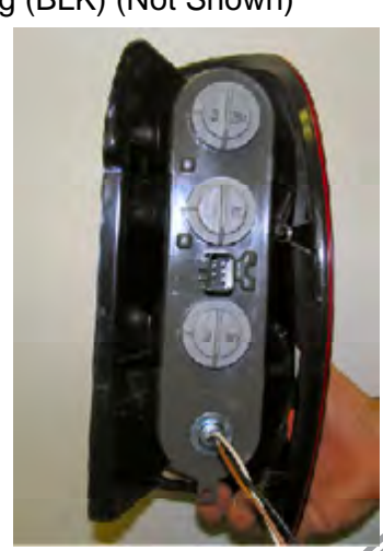
Location for the BX8869 on driver's side tail light assembly.

IMPORTANT: Use only genuine factory replacement parts on your Base Plate. Do not substitute homemade or nontypical parts. If a bolt is lost or in need of replacement, for your safety and the preservation of your Base Plate, be sure to use a replacement bolt of the same grade (Usually Grade 5, refer to parts list). Repair parts may be ordered through your nearest Blue Ox dealer or distributor.