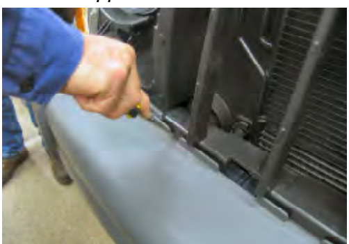
9. Push the two tabs down with the flat screw driver, pull fascia forward, unplug electrical connections, if applicable and set aside.