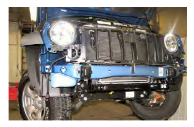
13. Reinstall hubs on the front of metal bumper with the existing bolts and 10MM socket.