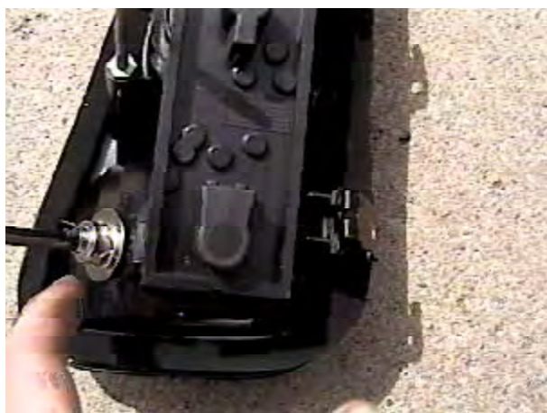
Driver's side view of the tail light assembly and the location for the BX8869.