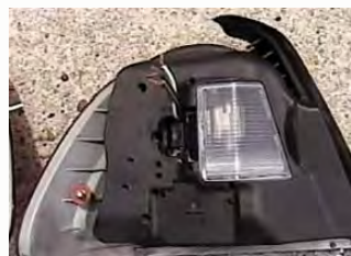
Location for the BX8869, passenger's side.