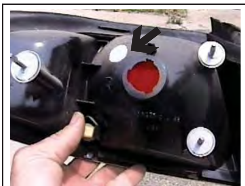
Location for the BX8869, (View of driver's side)