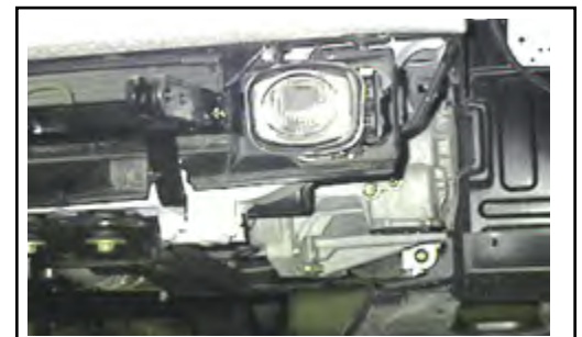
Fog Lights Replaced