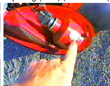
Location for the BX8869 on the driver's side.

IMPORTANT: Use only genuine factory replacement parts on your Base Plate. Do not substitute homemade or nontypical parts. If a bolt is lost or in need of replacement, for your safety and the preservation of your Base Plate, be sure to use a replacement bolt of the same grade (Usually Grade 5, refer to parts list). Repair parts may be ordered through your nearest Blue Ox dealer or distributor.