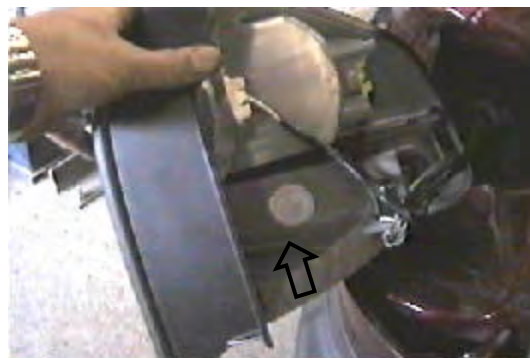
Location for the BX8869.