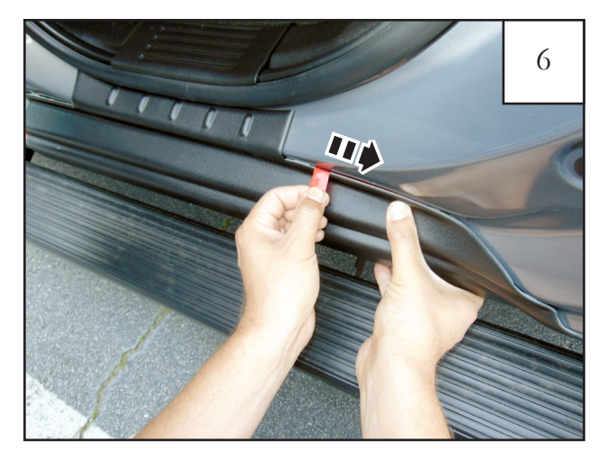
Pull tape liner tab 3.