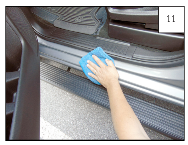
The Front Side Panel installs with the same preparation methods as the rear.