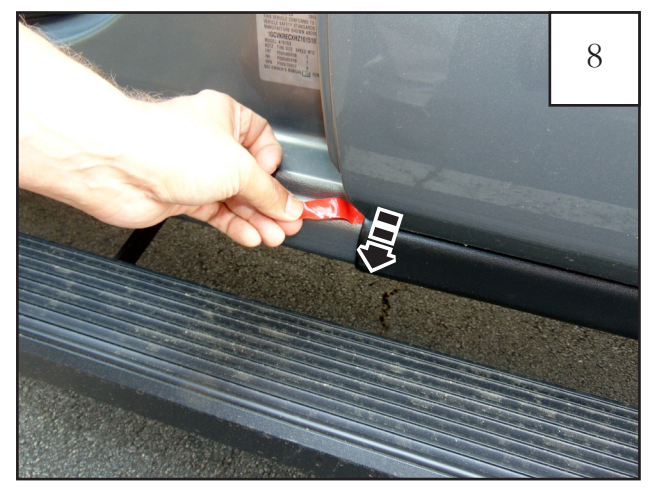
Pull tape liner tab 5. NOTE: It may be necessary to partially close door in order to access tab.