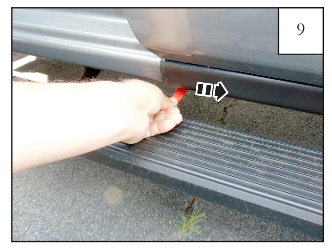
Pull tape liner tab 6. NOTE: It may be necessary to partially close door in order to access tab.