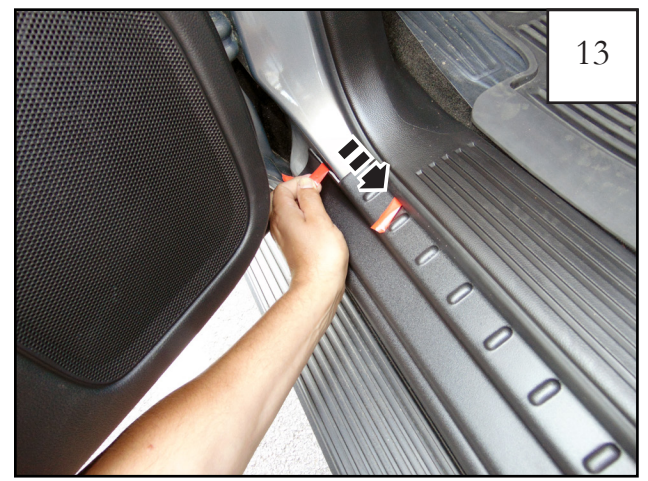
Pull tape liner tab 1.