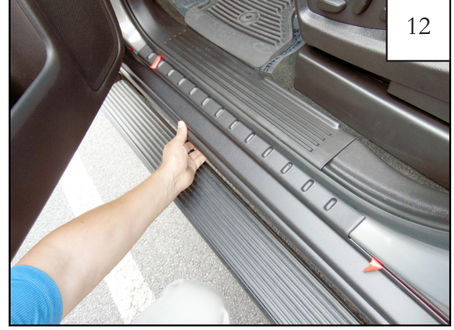
Place part on vehicle, making sure to line up edges of part with edges of vehicle. Ensure that all tape tabs are accessible. Firmly press on exposed areas of tape to tack Trail Armor in place. NOTE: Refer to step 10 for placement of certain tabs.