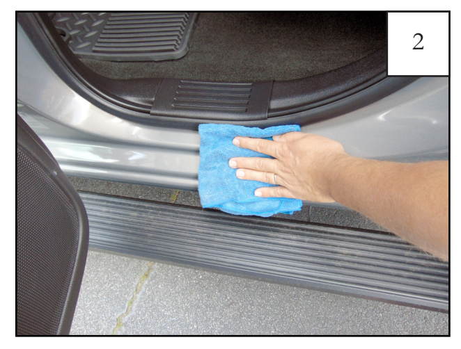
Open vehicle door. Clean all dirt and debris from vehicle then use supplied alcohol wipe where part will attach. NOTE: Temperature should be at least 60°F for proper tape adhesion.