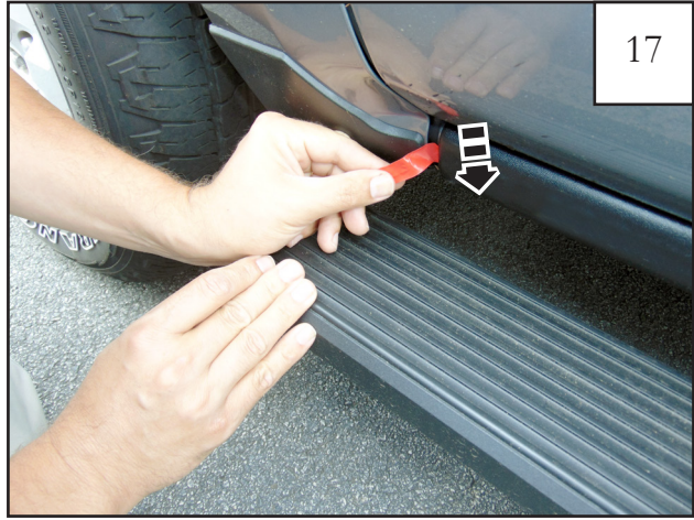
Pull tape liner tab 5. NOTE: It may be necessary to partially close door in order to access tab.