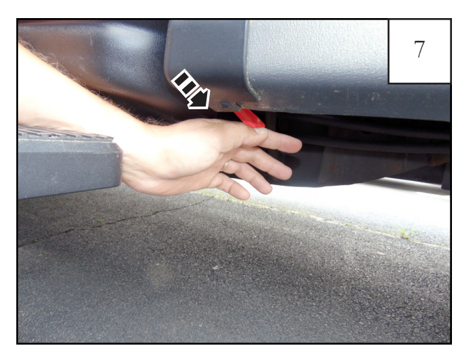
Pull tape liner tab 4.