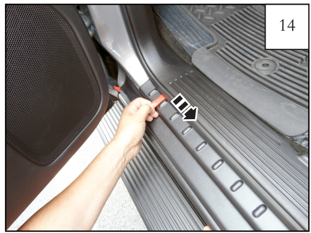
Pull tape liner tab 2.