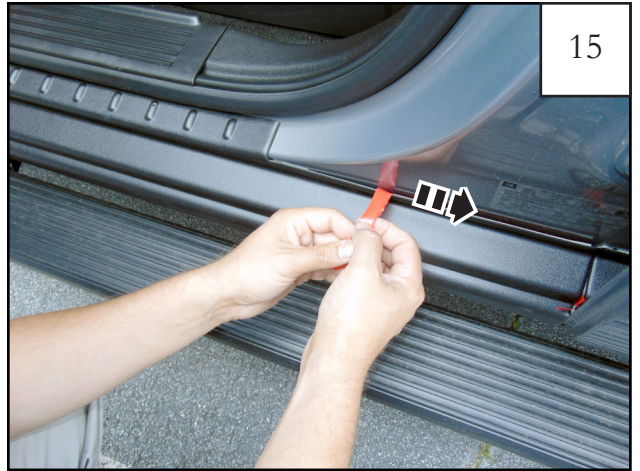
Pull tape liner tab 3.