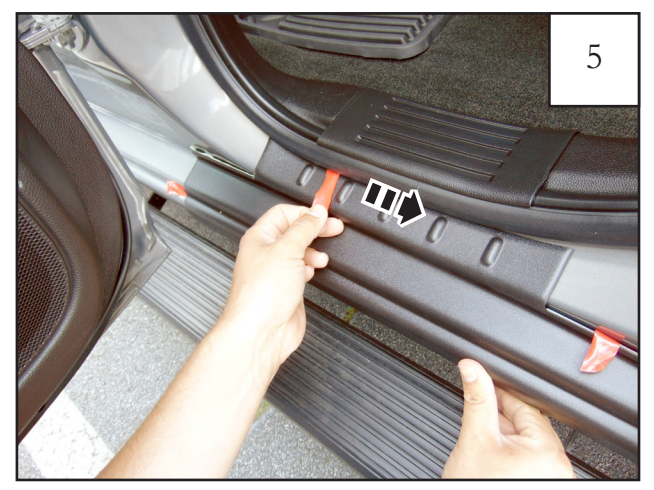
Pull tape liner tab 2.

Place part on vehicle, making sure to line up edges of part with edges of vehicle. Ensure that all tape tabs are accessible. Firmly press on exposed areas of tape to tack Trail Armor in place. NOTE: Refer to step 1 for placement of certain tabs.