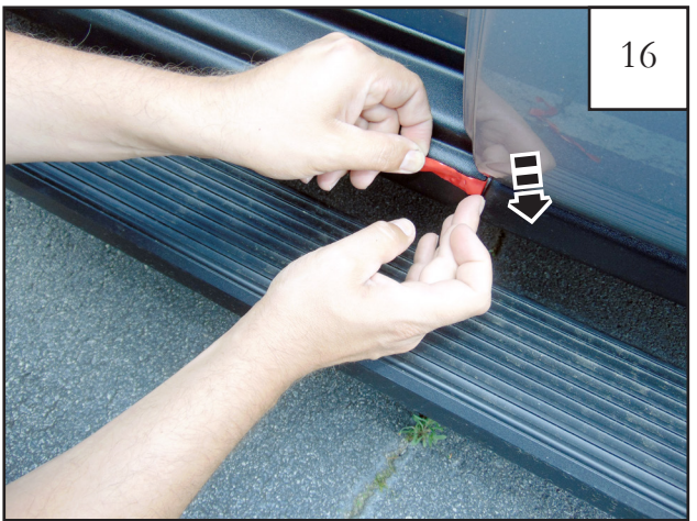
Pull tape liner tab 4.