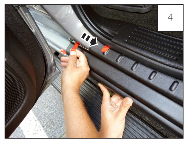
Pull tape liner tab 1.