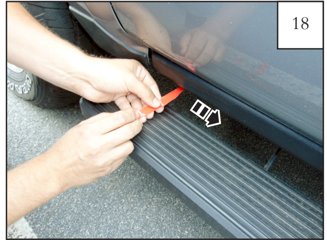
Pull tape liner tab 6. NOTE: It may be necessary to partially close door in order to access tab.