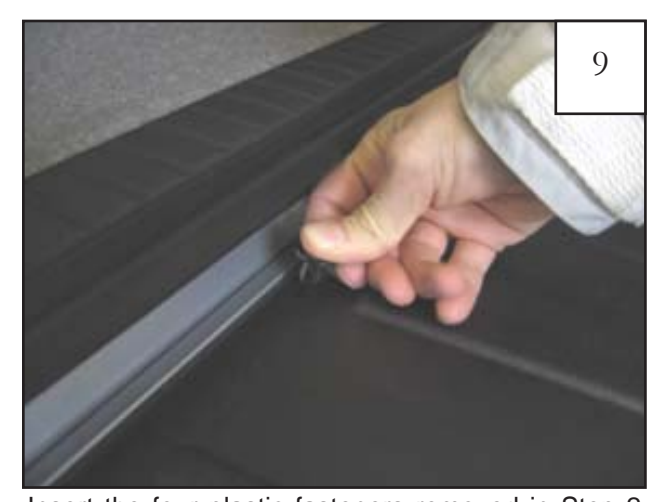
Insert the four plastic fasteners removed in Step 2 through the holes in the bumper protector and into the holes in the bumper threshold. Press into place.