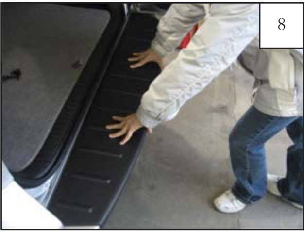
Press the part into place starting at the left side, pushing downward and forward while working your way to the right. Apply 30 PSI to the taped areas for proper bond. Tape reached maximum adhesive bond after 24 hours of contact.