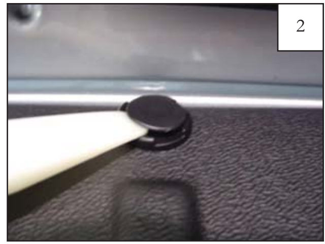
Using a nylon tool, remove the four factory plastic fasteners in the bumper threshold. Retain these fasteners for later use.