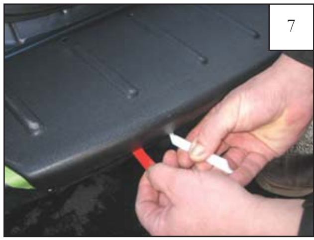
When peeling liner along front edge of part, run edge trim tool along under part in front of liner to create a small gap for ease of liner removal.