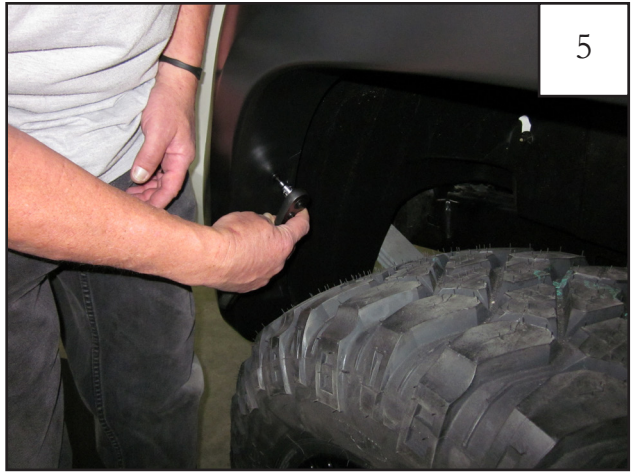
Place flare on vehicle and install one factory screw where shown to hold in place.