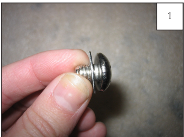
Put a Washer (WA1-0012) on each Bolt (SW1-0059).