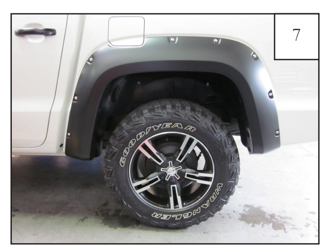
Remove flare and enlarge the marks on bumper cover.