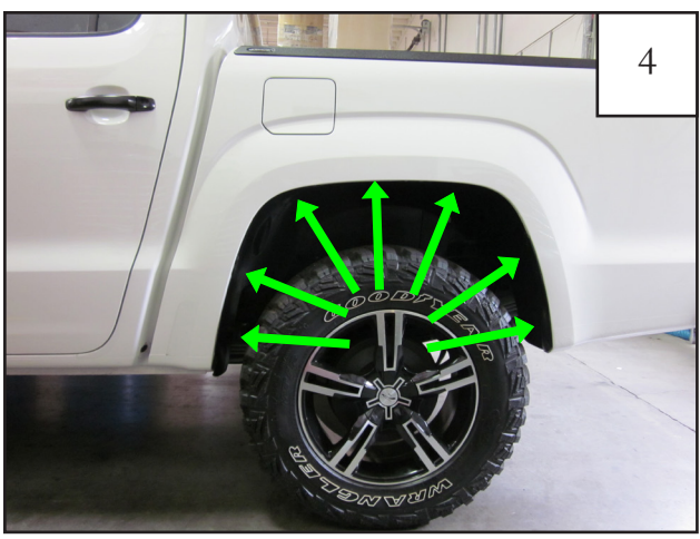
Using an T-25 Torx bit, remove 7 factory screws. Retain screws for reinstallation.