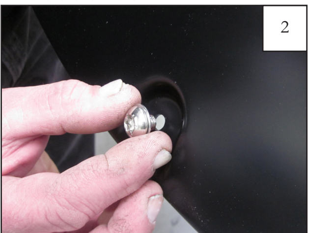
Put each Bolt/Washer combination through a pocket hole in the flare, Bolt head and Washer on the outside.