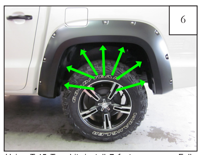
Using T-45 Torx bit, install 7 factory screws. Fully tighten all screws while pressing in on flare to ensure it is snug against sheet metal.