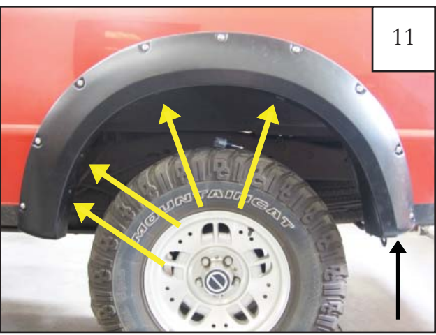
Ensure proper placement of flare and tighten all screws and the brace nut.