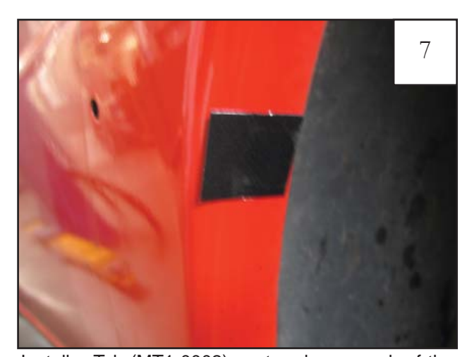
Install a Tab (MT1-0002) centered over each of the four holes marked in Step 6. Edge of Tab should be even with edge of sheet metal.