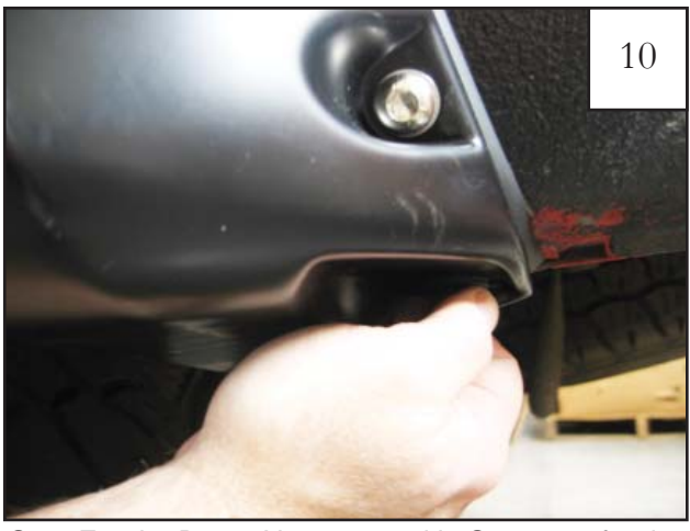
Start Fender Brace Nut removed in Step 4 on fender brace bolt.