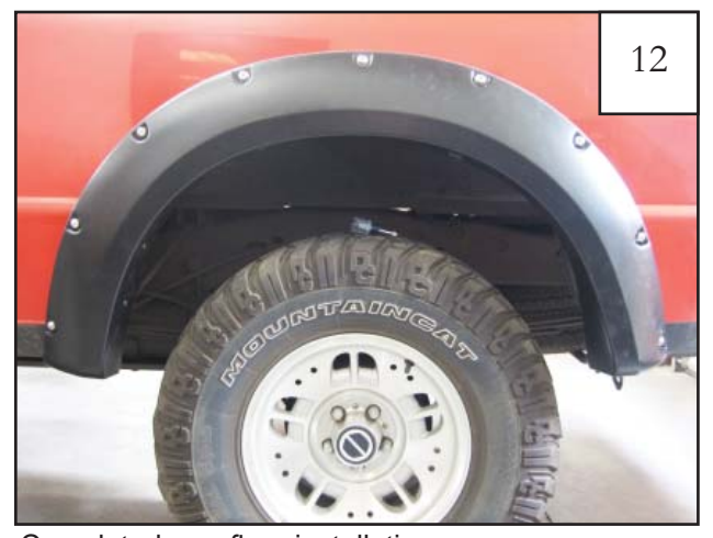
Completed rear flare installation.