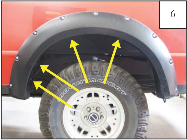
Mark through all flare holes using a grease pencil. Remove Flare.