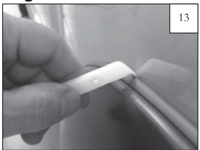
Using supplied Edge Trim Tool (ET1-0002), seat edge trim against vehicle by hooking curved end under edge trim at one end of flare. Next, slide around outer edge of flare to the other end.