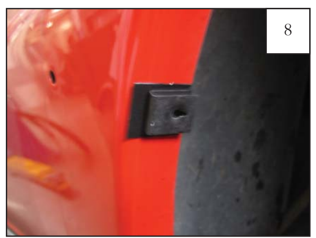
Install an Clip (CL1-0005) over each of the Tabs installed in Step 7.