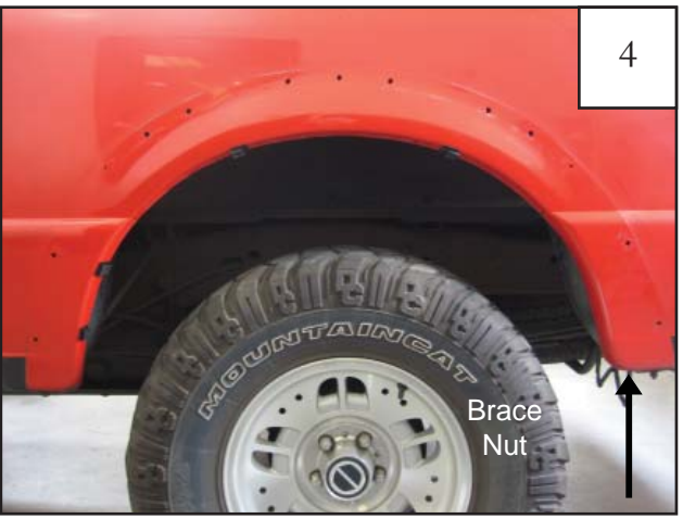
Remove any installed factory flares, mud flaps, or stone guards and clean wheel well opening. Remove rear Fender Brace Nut with a 13mm socket. Save brace nut for reinstallation.