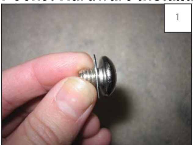
Put a Washer (WA1-0012) on each Bolt (SW1-0059).