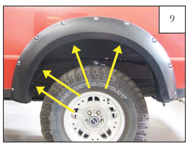
Reposition flare on fender ensuring that fender brace bolt is through lowest rearward hole and, starting with the rearmost wheel well hole, start Screws (SW1-0050) through holes in flare and into Clips (CL1-0022) with a #2 Phillips screwdriver.