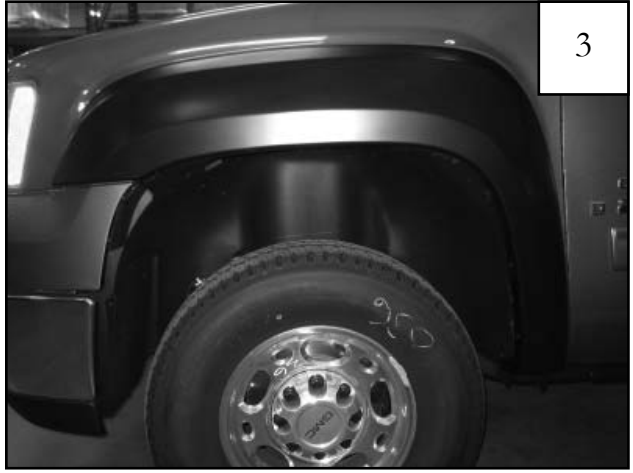
Verify fit and tighten all screws.