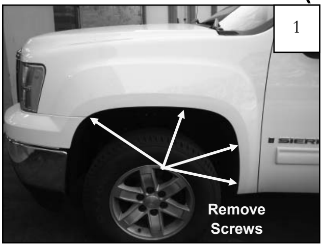
Using a 7mm socket, remove four factory screws. Retain screws for later use.