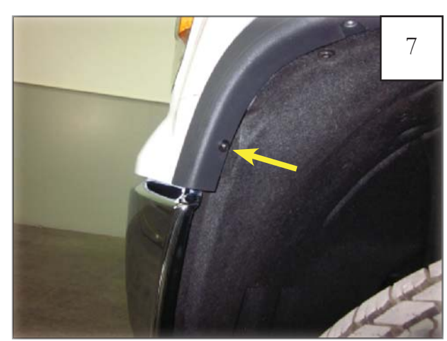
Remove fastener from front of factory wheel arch molding using a 9/32" or 7mm socket and wrench. Save for reinstallation.