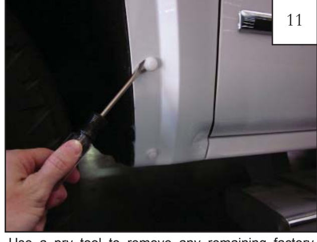
Use a pry tool to remove any remaining factory fasteners that may have stayed on the vehicle during the removal process.