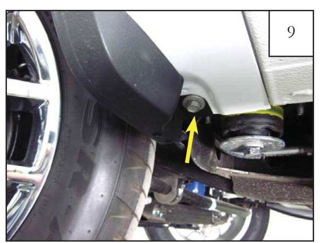
Remove fastener from rear underside of factory wheel arch molding using a 1/2" socket and wrench. Save for reinstallation.