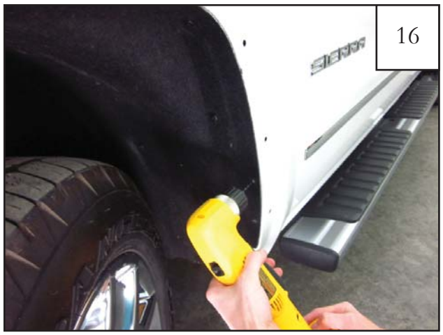
Remove the flare. Using a 3/32" drill bit, drill a pilot hole through the factory wheel well liner and sheet metal at location marked in previous step.