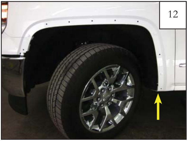
Reinstall factory fastener removed in step 9 using a 1/2" socket and wrench.