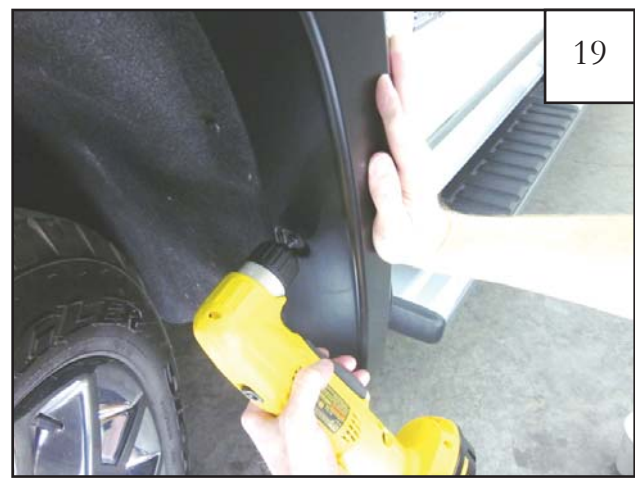
Install self-tapping screw (SW1-0066) into pilot hole drilled in step 16. Press flare towards vehicle while fully tightening. Note: This step not needed for models with factory installed mudflaps.