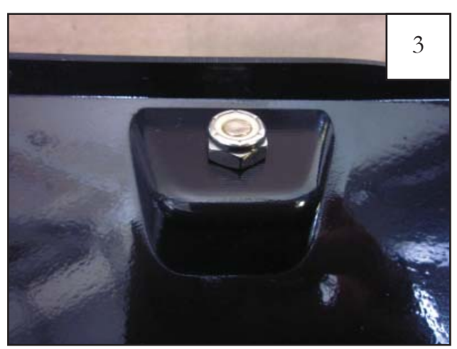
Place a Nut (NU1-0019) over the end of each Bolt and tighten, using a 1/2" wrench for the Nut and the supplied Torx Bit (SW1-0052) for the Bolt. Repeat for remaining pockets.