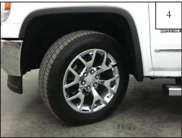
Turn front tire outward for easier installation. Factory wheel arch molding must be removed prior to part installation. See next steps.

Front Flare Installation Procedures (Passenger Side):