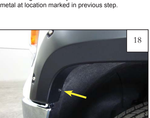
While holding Flare on vehicle, install factory screw removed in step 7 through flare and into factory hole. Do not fully tighten at this time.