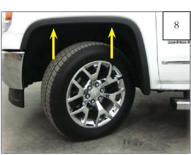
Remove two fasterners along top of factory wheel arch molding using a T-15 Torx bit.