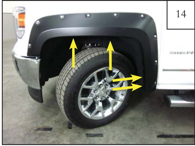
While holding Flare on vehicle, install supplied screw (SW1-0056) into the two upper and lower factory holes locations. Do not fully tighten at this time.