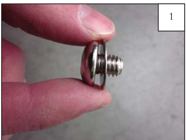
Put a Washer (WA1-0012) on each Bolt (SW1-0059).