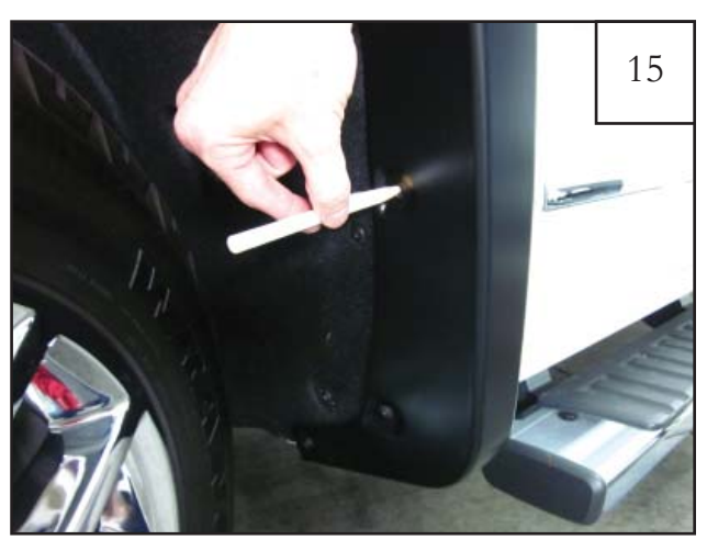
Using a grease pencil or marker, mark one hole location for drilling using the upper rear hole location in the flare as a guide. Note: This step not needed for models with factory installed mudflaps.