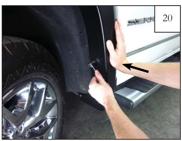
FOR MODELS WITH FACTORY MUDFLAP: Reinstall factory fastener removed from mudflap in step 5. Press flare towards vehicle while fully tightening using a T-30 Torx Bit.