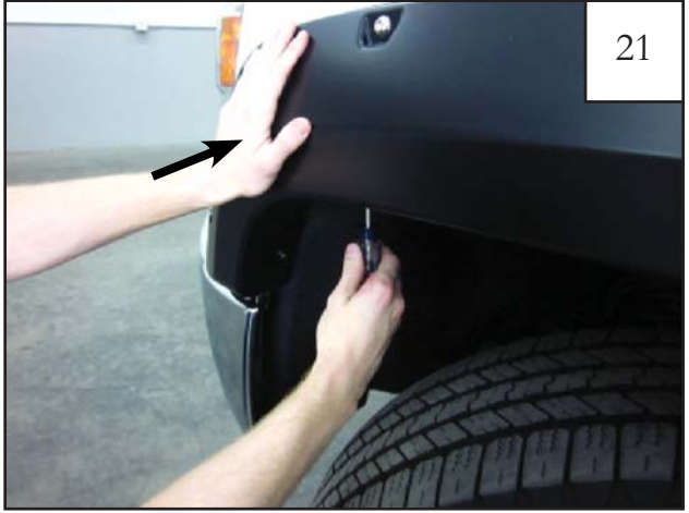
Press flare towards vehicle and fully tighten all remaining fasteners.