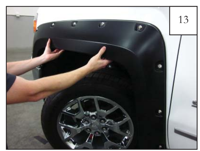
Hold Front Flare up to wheel well to confirm fit. Do not install fasteners at this time.