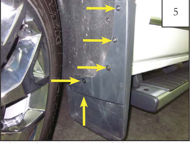
FOR MODELS WITH FACTORY MUDFLAP: Remove mud flap fasteners. Use T-30 Torx bit for two upper fasteners. Use T-15 Torx Bit for two lower fasteners and use a Phillips Head Screwdriver for Bottom fastener.