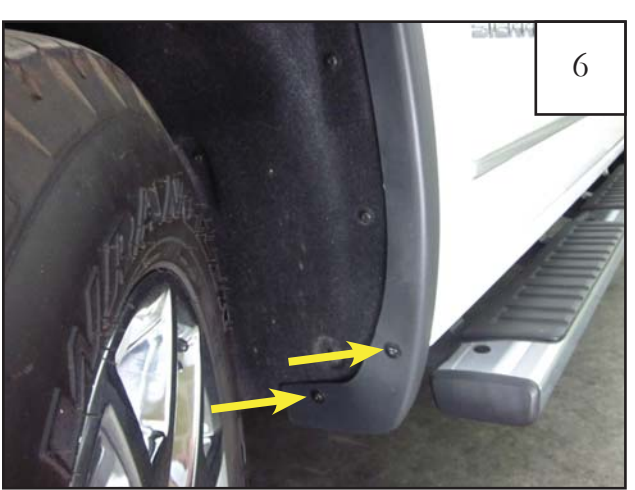
Remove two lower fasterners from factory wheel arch molding using a T-15 Torx Bit.