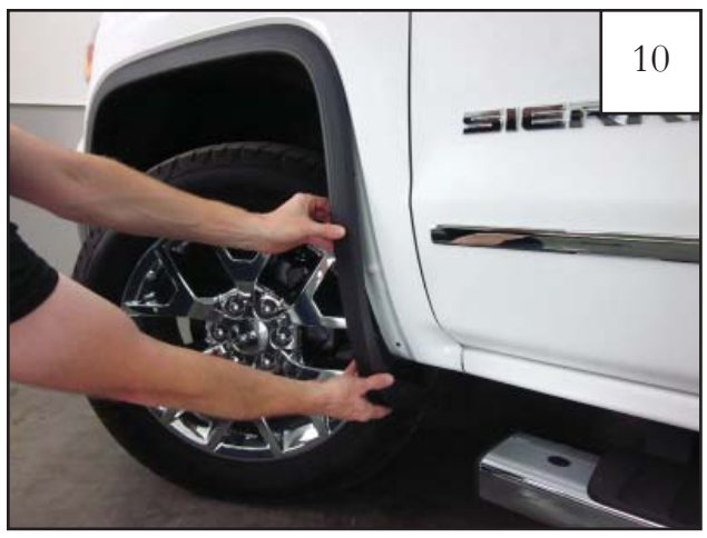
Starting at the lower rear end of the factory flare, firmly grip part and pull to remove from vehicle. Note: You will hear popping sounds as the factory fasteners release from vehicle. This is normal.