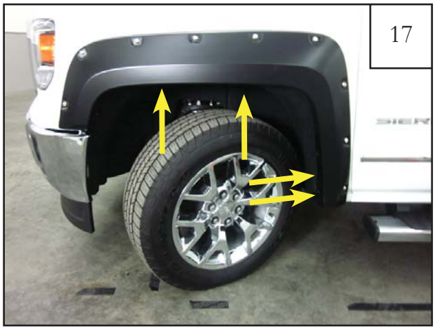
While holding Flare on vehicle, install supplied screws (SW1-0056) into the two upper and lower factory holes locations. Do not fully tighten at this time.