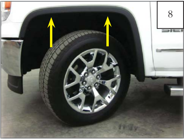
Remove two fasterners along top of factory wheel arch molding using a T-15 Torx bit.