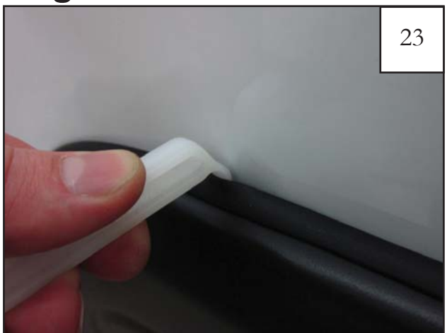
Using supplied Edge Trim Tool (ET1-0002), seat edge trim against vehicle by hooking curved end under edge trim at one end of flare. Next, slide around outer edge of flare to the other end.