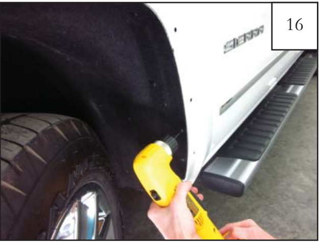
Remove the flare. Using a 3/32" drill bit, drill a pilot hole through the factory wheel well liner and sheet metal at location marked in previous step.