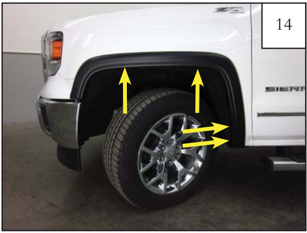
While holding Flare on vehicle, install supplied screw (SW1-0056) into the four factory hole locations as shown. Do not fully tighten at this time.