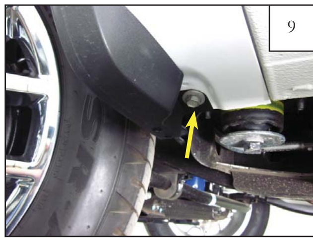
Remove fastener from rear underside of factory wheel arch molding using a 1/2" socket and wrench. Save for reinstallation.