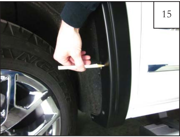
Using a grease pencil or marker, mark one hole location for drilling using the upper rear hole location in the flare as a guide. Note: This step not needed for models with factory installed mudflaps.