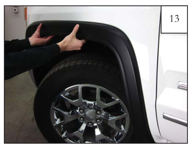
Hold Front Flare up to wheel well to confirm fit. Do not install fasteners at this time.