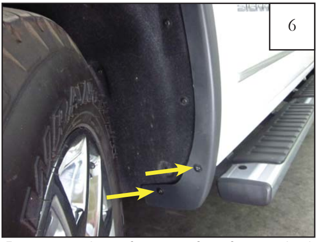
Remove two lower fasterners from factory wheel arch molding using a T-15 Torx Bit.