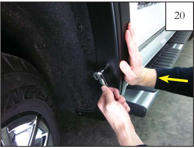
FOR MODELS WITH FACTORY MUDFLAP: Reinstall factory fastener removed from mudflap in step 5. Press flare towards vehicle while fully tightening using a T-30 Torx Bit.