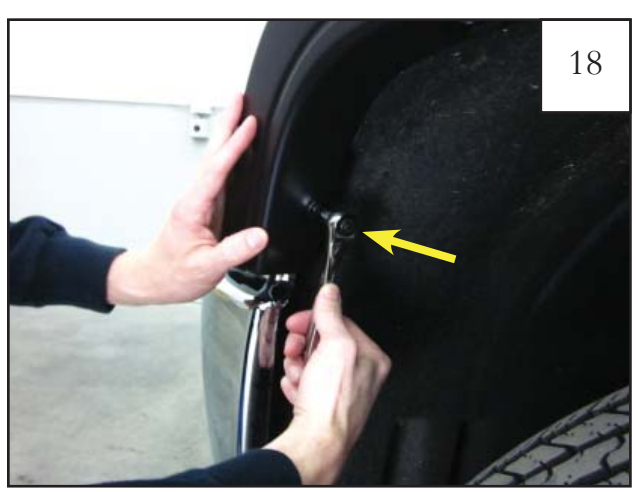
While holding Flare on vehicle, install factory screw removed in Step 7 through flare and into factory hole. Do not fully tighten at this time.