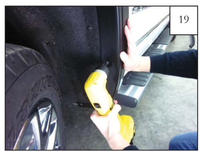
Install self-tapping screw (SW1-0066) into pilot hole drilled in step 16. Press flare towards vehicle while fully tightening. Note: This step not needed for models with factory installed mudflaps.