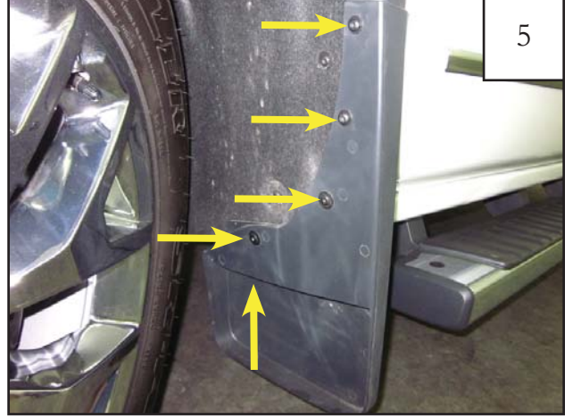
FOR MODELS WITH FACTORY MUDFLAP: Remove mud flap fasteners. Use T-30 Torx bit for two upper fasteners. Use T-15 Torx Bit for two lower fasteners and use a Phillips Head Screwdriver for Bottom fastener.