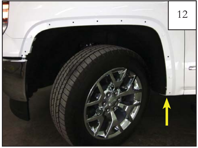
Reinstall factory fastener removed in step 9 using a 1/2" socket and wrench.