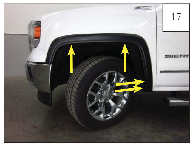
While holding Flare on vehicle, install supplied screws (SW1-0056) into the two upper and lower factory holes locations. Do not fully tighten at this time.