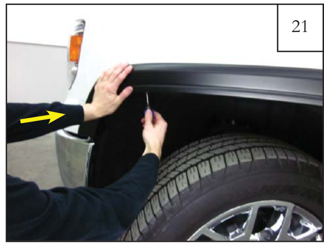
Press flare towards vehicle and fully tighten all remaining fasteners.