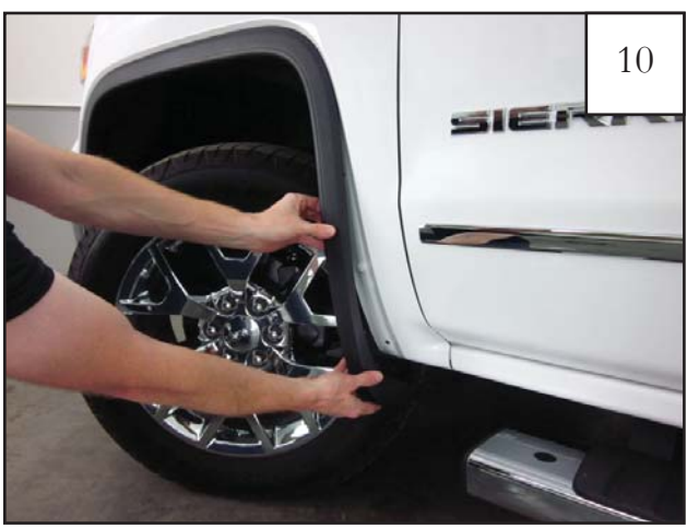
Starting at the lower rear end of the factory flare, firmly grip part and pull to remove from vehicle. Note: You will hear popping sounds as the factory fasteners release from vehicle. This is normal.