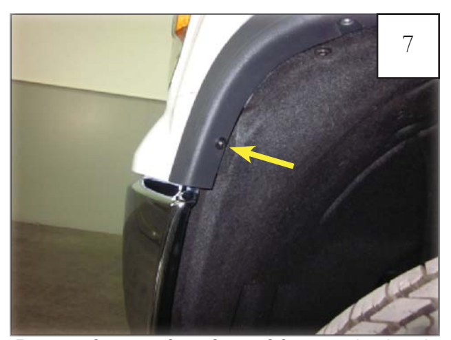
Remove fastener from front of factory wheel arch molding using a 9/32" or 7mm socket and wrench. Save for reinstallation.