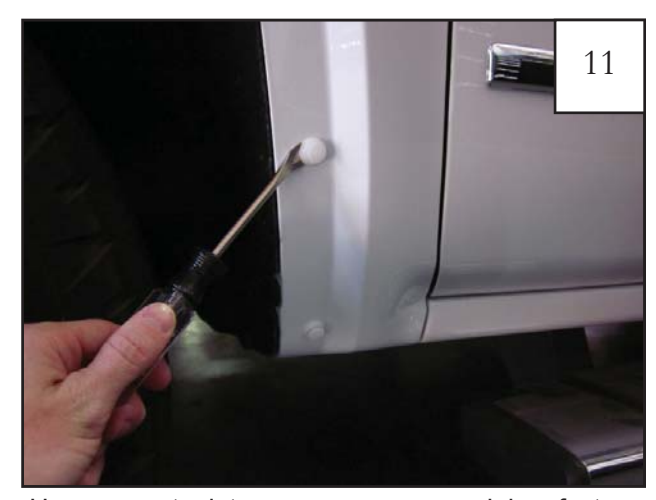
Use a pry tool to remove any remaining factory fasteners that may have stayed on the vehicle during the removal process.