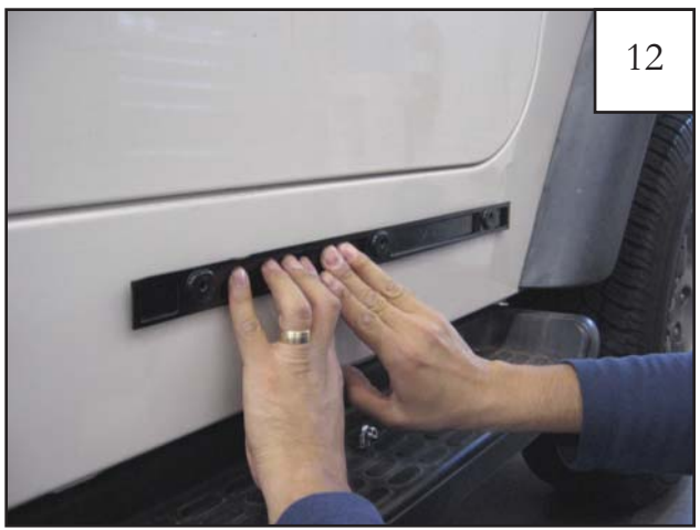
Apply 30 pounds of pressure per square inch to the inner pieces to ensure proper tape adhesion.