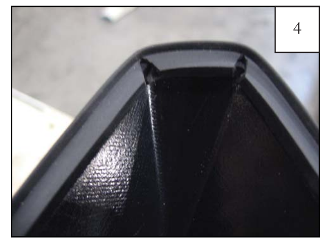
At sharp corners, use a utility knife to notch a "V" in edge trim, taking care not to cut front face of edge trim (four places each part)