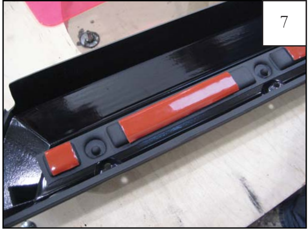
Align three indents in each taped inner piece with three holes in parts. Tape attached to inner pieces should be facing away from the inside of the part.