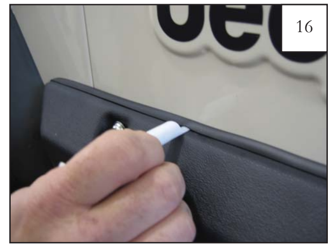
Using flat end of supplied Edge Trim Tool, seat bottom edge of edge trim first by inserting straight flat end between bottom edge of edge trim and part at one open end and slide over entire top edge to the other end.