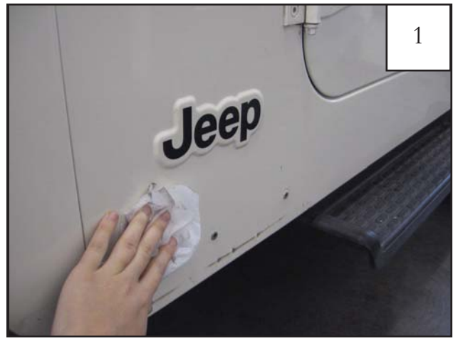
Wipe side of vehicle with alcohol wipe to remove grease and dirt.