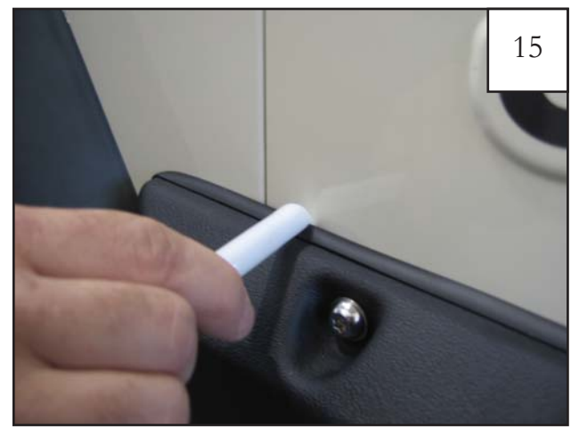
Using supplied Edge Trim Tool, seat top edge of edge trim first by hooking curved end under top edge at one open end and slide over entire top edge to the other end.