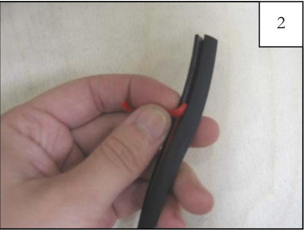
Peel two to three inches of red vinyl backing away from edge trim tape.