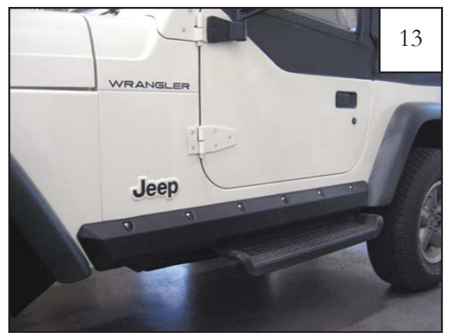
Reinstall part as shown in Step 8, taking care that screws are snug. Do NOT overtighten, as the screws may strip out.