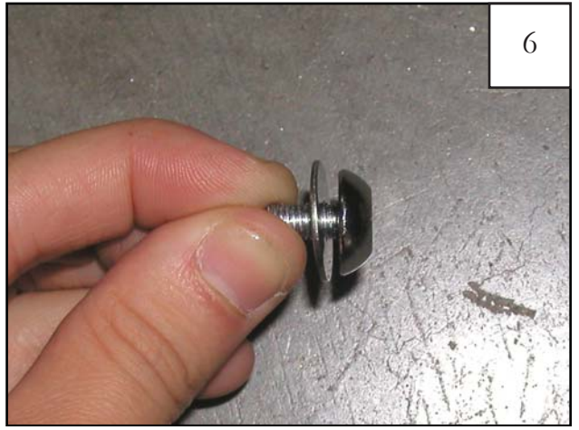
Slide a supplied washer (WA1-0007) onto a supplied screw (SW1-0032).