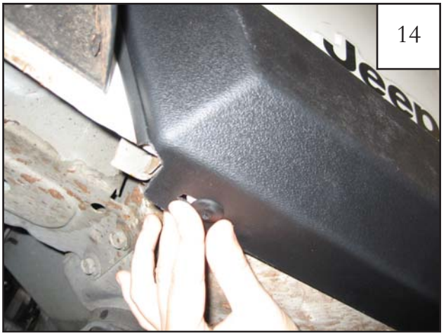
Attach underside edge of the Rocker Panel to the vehicle using supplied Tuflocs fasteners (RV1-P001), pressing Tuflocs through slots and into factory holes.