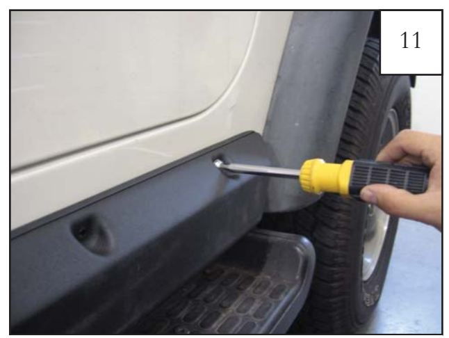
Once part is positioned, press firmly on screw heads to adhere inner pieces to vehicle. Remove screws and remove outer part from vehicle, leaving the inner pieces on the body.