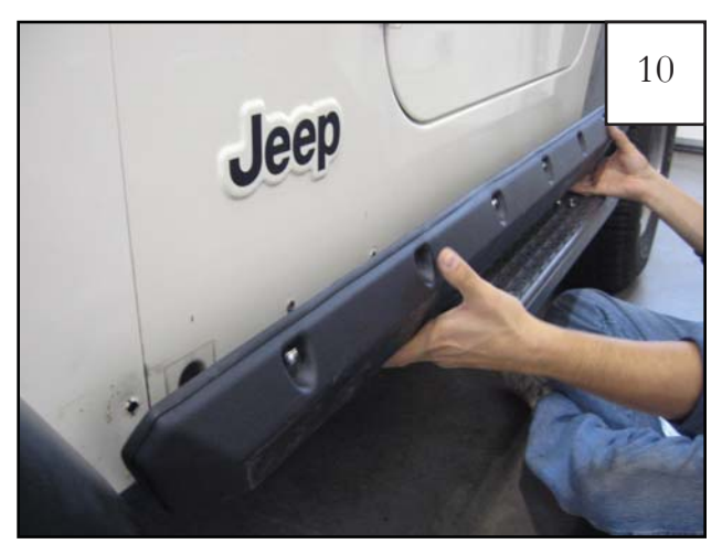
Gently position part on vehicle, centering between fender flares (about 1/4" to 3/8" space on each side). Take care not to press the part onto vehicle until properly positioned.