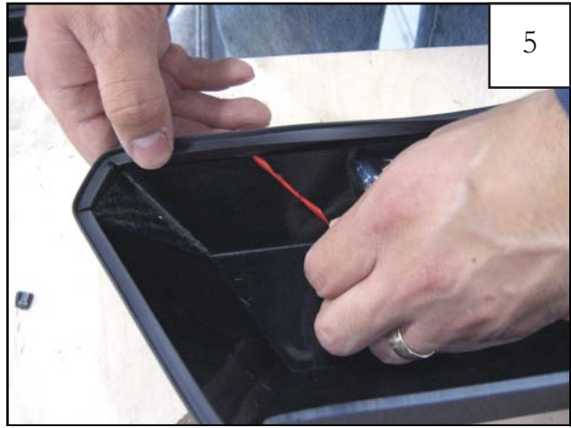
Press edge trim (GP1-0005) into place along the top edge of the flare in one foot increments, pulling red vinyl backing free as you go.