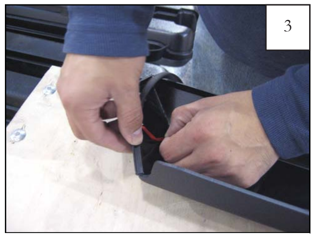
Applying the adhesive side of the edge trim (GP1-0005) to the inner side of part, affix edge trim to the top edge of the part (the portion that comes in contact with vehicle).