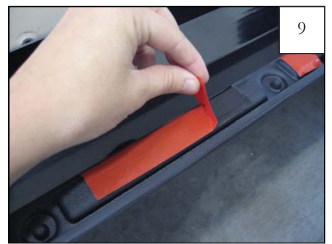
Remove red vinyl backing from tape pads. NOTE: Check part for engraved "14008R" or "14008L" prior to proceeding to the next step. The left part will go on the driver's side.