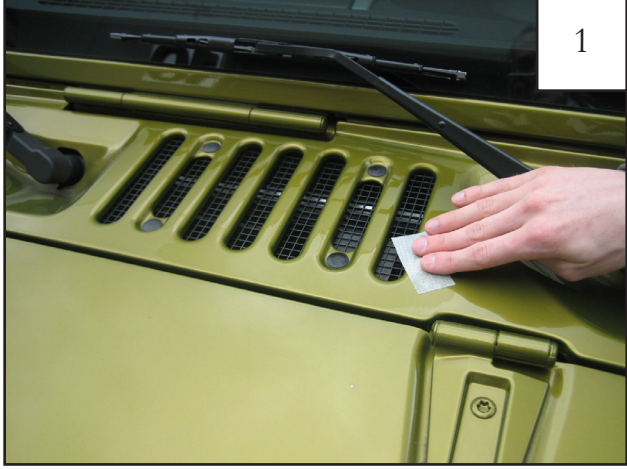
Clean the cowl grille area with the enclosed alcohol prep pad.