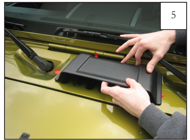
Hold the part at an angle to prevent tape from prematurely sticking, and align the part on the hood using marks made in Step 3 as a guide. NOTE: If necessary, lift windshield wiper out of the way.