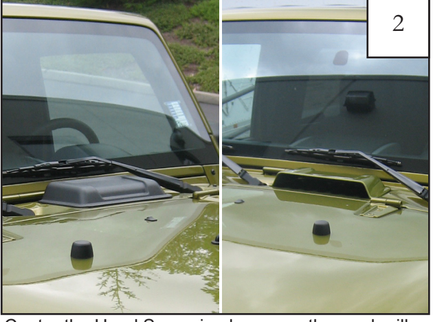
Center the Hood Scoop in place over the cowl grille in desired orientation.

To claim a warranty, you must provide Proof of Purchase.