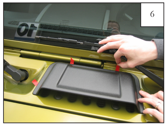
Maintaining part placement, begin pulling tape tabs while applying downward pressure to part.