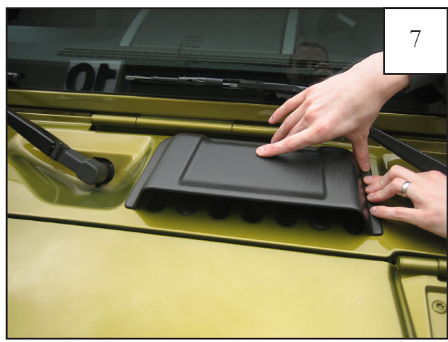
Press part into place. Apply 30 PSI to the taped areas for proper bond. The tape reaches maximum adhesive bond after 24 hours of contact. Do not wash vehicle for 24 hours.