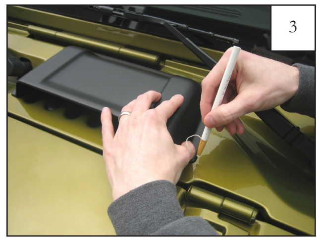
Once positioned, use a grease pencil to lightly trace around edges of part.