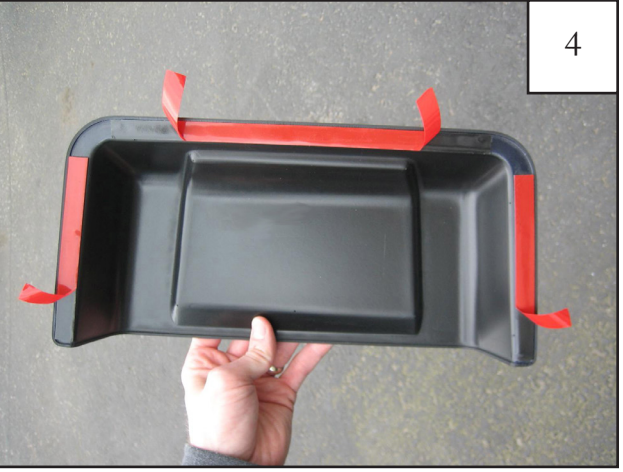
Remove part and peel red liner partially from tape pads as shown. NOTE: Make sure tabs are folded toward the outside of the part and are accessible to pull once part is repositioned.