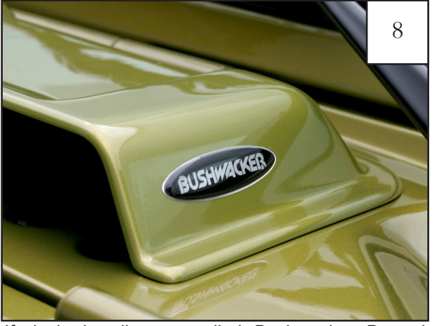
If desired, adhere supplied Bushwacker Domed labels to outside of part.