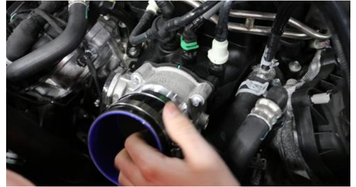
9. Locate the Ø3.5" straight sleeve and two #56 clamps. Install straight sleeve with one clamp onto throttle body and tighten clamp with flathead screwdriver or ratchet and 8mm socket. Loosely place other clamp onto straight sleeve.