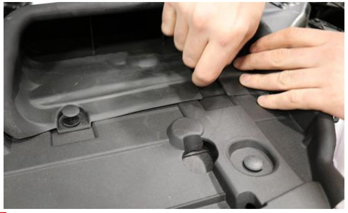
5. Locate the air scoop retaining clips from removal step 8 and attach factory scoop.