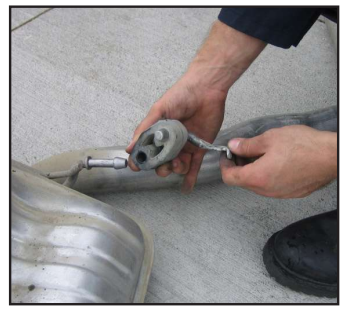
FIG. F INS 5123 9/14/09