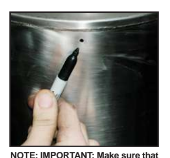
small drain holes of each tunnel muffler face down when installed.