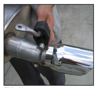
FIG. U INS5142 9/17/09