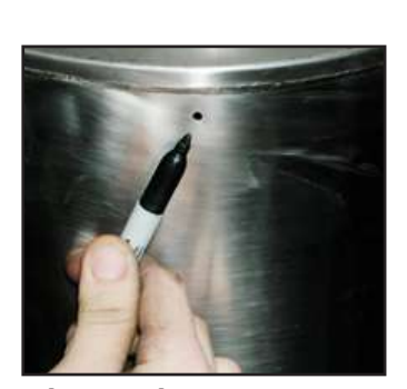
NOTE: IMPORTANT: Make sure that small drain holes in rear of each tunnel muffler face down when installed