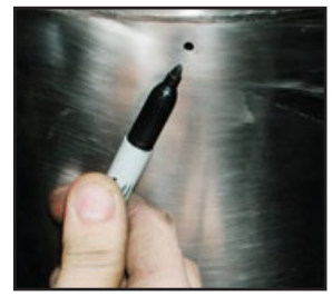
NOTE: IMPORTANT: Make sure that small drain holes in rear of each tunnel muffler face down when installed.

NOTE: During cold weather start-ups, you may experience an exhaust sound that is deeper and louder in tone than usual. This is temporary and will diminish to normal levels once your engine has reached its normal operating temperature.