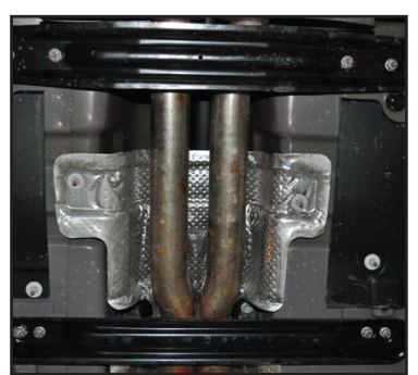
FIG. H INS5196 3/17/11