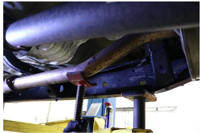
2. Support the front of the system using a jack stand or similar device.

NOTE: Penetrating lubricant may make this step easier.