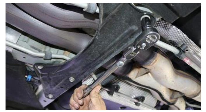
Then reinstall the Cross Member with a 13mm socket (or wrench) and the 5 Factory bolts. Tighten all bolts to the manufacturer's specifications.

Once the entire exhaust system is properly adjusted, tighten all clamps to 45ft-lbs (61Nm) using the torque wrench and 15mm socket.