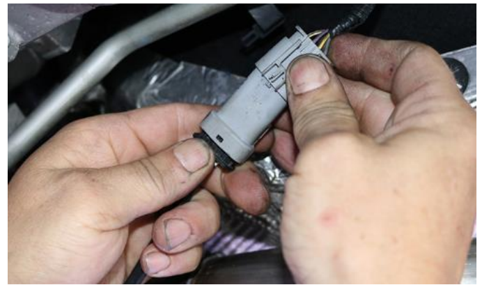
16. Reconnect the Passenger-side O2 sensor wiring harness plug.