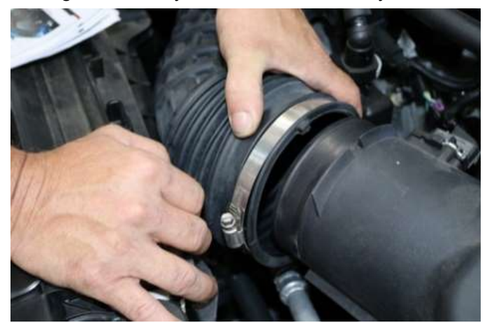
4. Using a flat screw driver, un-screw hose clamp from the air duct and remove from intake housing.

2. Using a 10MM socket or wrench, disconnect the negative battery cable from the battery.