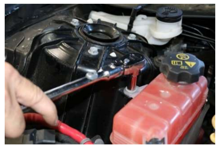
14. Using a 10MM socket or wrench, reinstall the coolant reservoir. Make sure to remove your plug and reconnect the front hose. NOTE: Check coolant level and fill as appropriate.