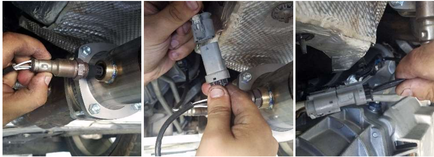
22. Re-install the o2 sensors into the bungs. Tighten using a 22mm open end wrench or O2 sensor socket. Make sure that you have the correct sensors in the positions that you labeled them as when you removed them.