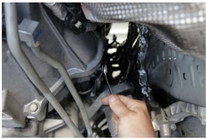
21. Use a 10MM socket or wrench to remove heat shield around the starter. Save for re-installation ( Install Step # 6 ).

20. Using a 11MM socket or wrench unbolt the steering shaft at the top and slide it out of the shaft coming out of the steering column. Move out of the way to make extra room to unbolt the factory manifold. Take care to not turn the shaft as it could cause problems with steering, alignment, and the airbag.