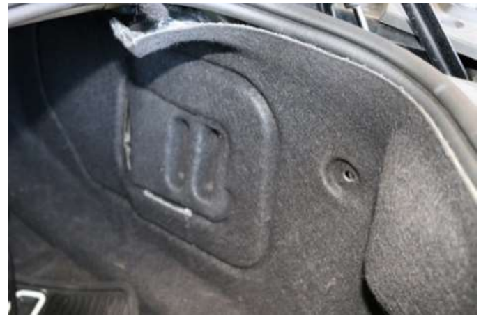
24. Close the battery compartment

23. Using a 10MM socket or wrench, reconnect the negative battery cable from the battery.