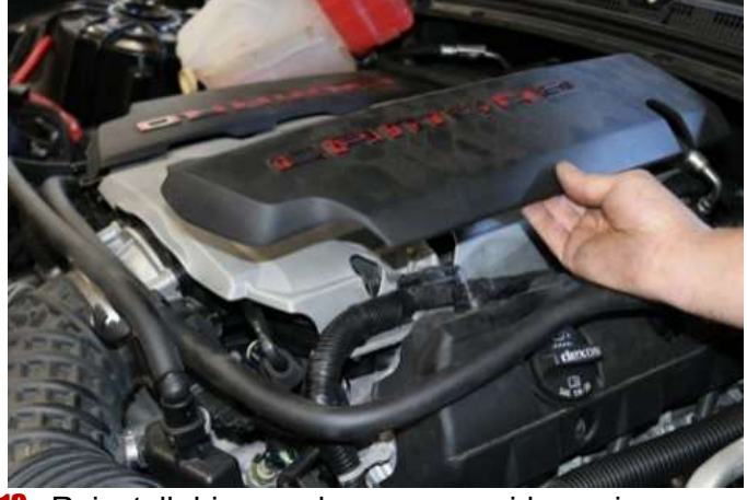
13. Reinstall driver and passenger side engine cover From Removal Step 7 .

12. Reinstall the dip stick mounting bracket, dipstick, and plug wires. Then using a T30 socket, reinstall all coil covers From Removal Step 8 .