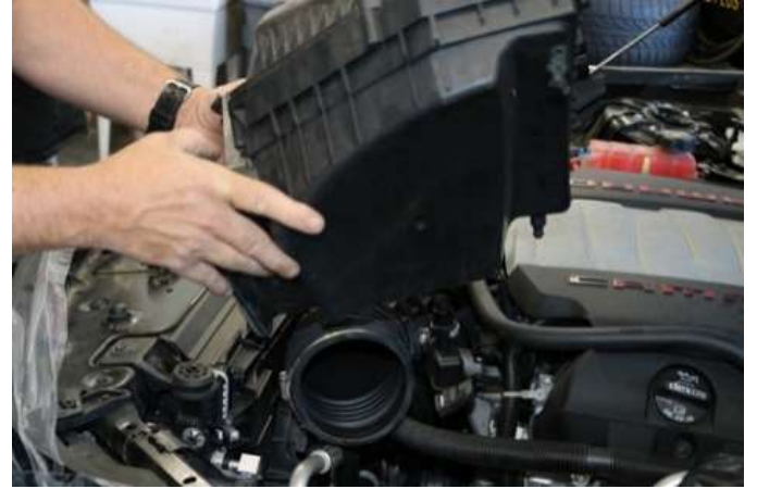
15. Reinstall air intake From Removal Step 5 . Make sure to tighten the clamps on the air ducts.