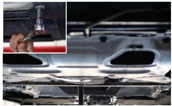
Using 7MM and 10MM sockets or wrenches, remove all plastic covering from underneath the front of the vehicle. Save for re-installation (Install Step # 9).