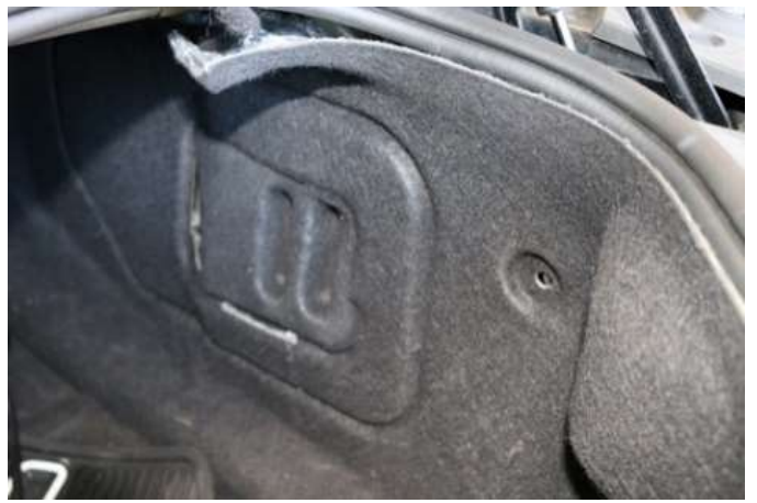
Access the trunk of the vehicle. On the passenger side, locate the battery compartment.