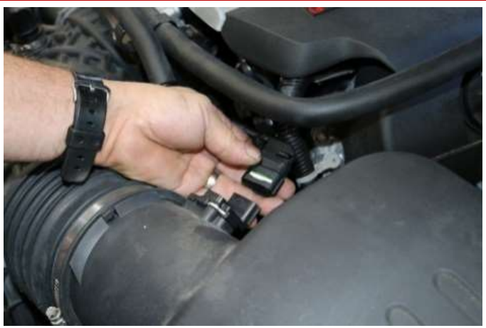
16. Plug in the air intake MAF sensor.