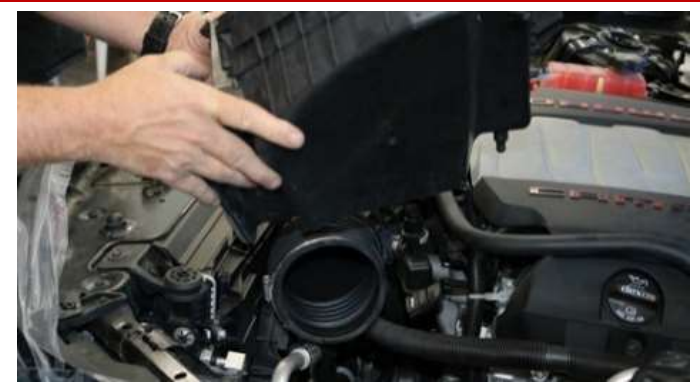
Remove air intake box. Save for re-installation (Install Step # 15)