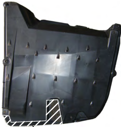
TRIM UNDERBODY PANEL TRIM DIAGRAM