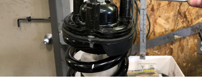
13. Install Daystar Strut Spacer to top of factory strut

12. Install provided kit Stud Extenders onto factory strut studs Note: Add provided kit thread lock to factory strut