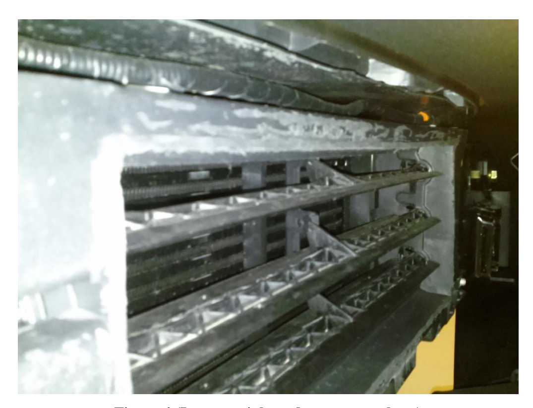
Figure 4 (Louver w/ shroud cut away at base)

G. If your vehicle model includes a louver system for the intercooler located between the frame mounts, the shroud must be removed. Special care must be taken not to damage louvers when cutting around the base of the rectangular shroud, a cut off wheel is recommended.