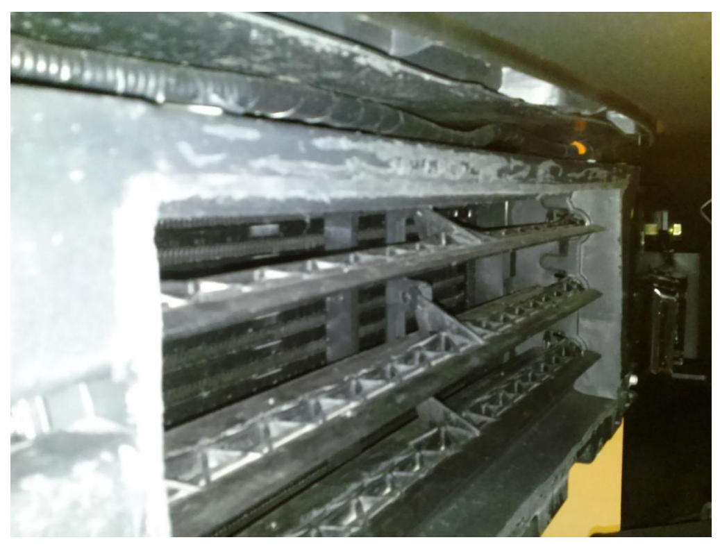
Figure 4 (Louver w/ shroud cut away at base)

G. If your vehicle model includes a louver system for the intercooler located between the frame mounts, the shroud must be removed. <u>Special care must</u> <u>be taken not to damage louvers when cutting around the base</u> of the rectangular shroud, a cut off wheel is recommended.