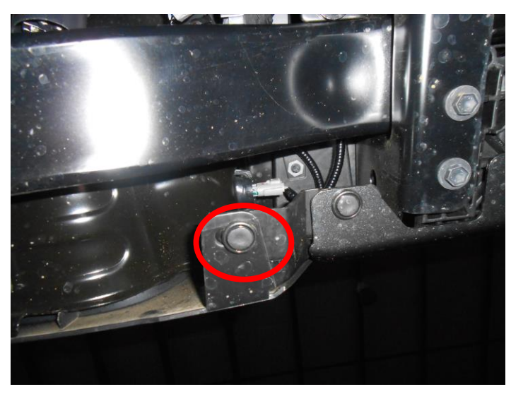
E. Use a 12mm socket to remove 10 bolts on the metal piece of the lower bumper.

Product Number: E3651 Application: 2016-2019 Tacoma