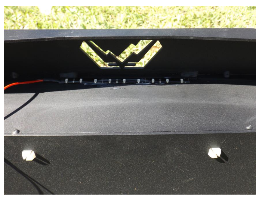
Figure 5 - LED Strip Location